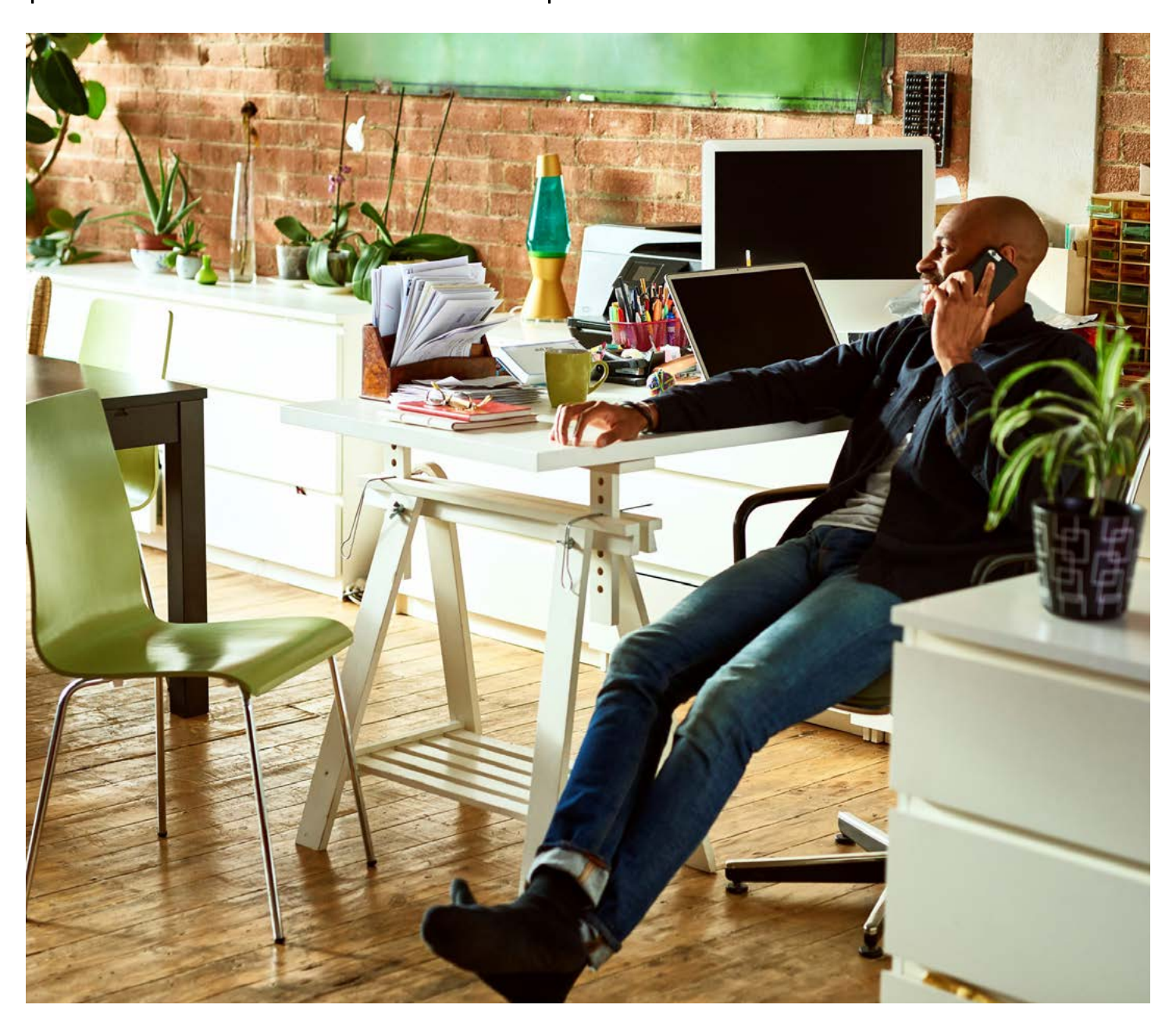
XEROX® ROBOTIC PROCESS AUTOMATION SERVICE