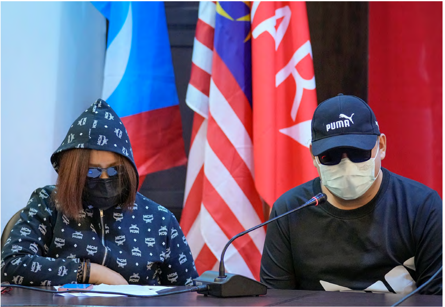
Malaysian victims of job scams attend a press conference in Petaling Jaya, Malaysia, on September 21, 2022. They said they were offered high-paying jobs in Thailand, but instead they were taken to a casino complex in Myanmar near the Thai border.

the region. Things have reached the point where armed police operations struggle to gain access to many of these enclaves because their armed protection is so formidable. In both Cambodia and Myanmar, criminals have, with impunity, openly murdered trafficked victims who have attempted to escape compounds.