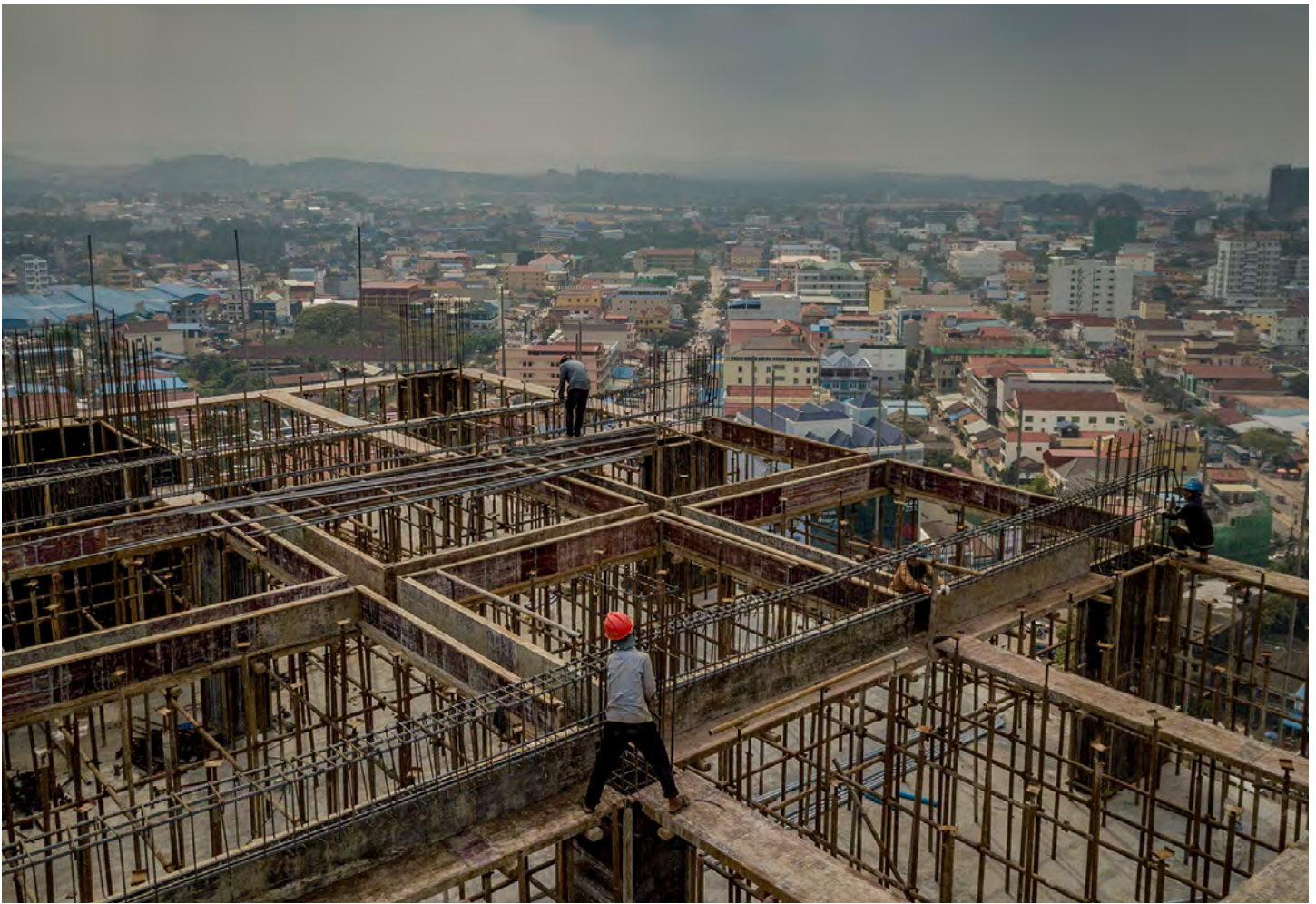
Construction workers on a new Chinese-financed casino, condo, and hotel development on the seafront in Sihanoukville, Cambodia, on February 17, 2018. During the COVID-19 pandemic, developments like this were converted into militarized scam compounds.