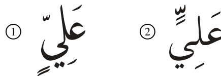
Figure 8-5. Placement of Harakat

Arabic-Indic Digits. The names for the forms of decimal digits vary widely across different languages. The decimal numbering system originated in India (Devanagari ०१२३...) and was subsequently adopted in the Arabic world with a different appearance (Arabic ·٠١٢٣...). The Europeans adopted decimal numbers from the Arabic world, although once again the forms of the digits changed greatly (European 0123...). The European forms were later adopted widely around the world and are used even in many Arabic-speaking countries in North Africa. In each case, the interpretation of decimal numbers remained the same. However, the forms of the digits changed to such a degree that they are no longer recognizably the same characters. Because of the origin of these characters, the European decimal numbers are widely known as “Arabic numerals” or “Hindi-Arabic numerals,” whereas the decimal numbers in use in the Arabic world are widely known there as “Hindi numbers.”