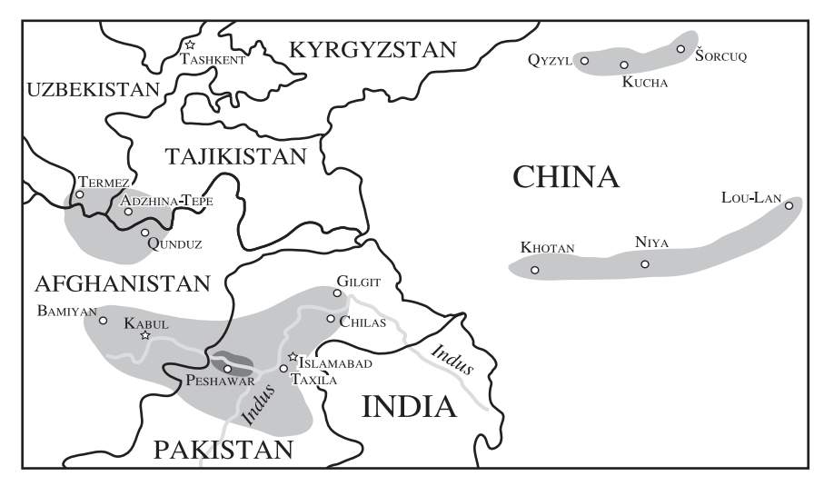
Figure 14-2. Geographical Extent of the Kharoshthi Script

The exact details of the origin of the Kharoshthi script remain obscure, but it is almost certainly related to Aramaic. The Kharoshthi script first appears in a fully developed form in the Aśokan inscriptions at Shahbazgarhi and Mansehra which have been dated to around 250 BCE. The script continued to be used in Gandhara and neighboring regions, sometimes alongside Brahmi, until around the third century CE, when it disappeared from its homeland. Kharoshthi was also used for official documents and epigraphs in the Central Asian cities of Khotan and Niya in the third and fourth centuries CE, and it appears to have survived in