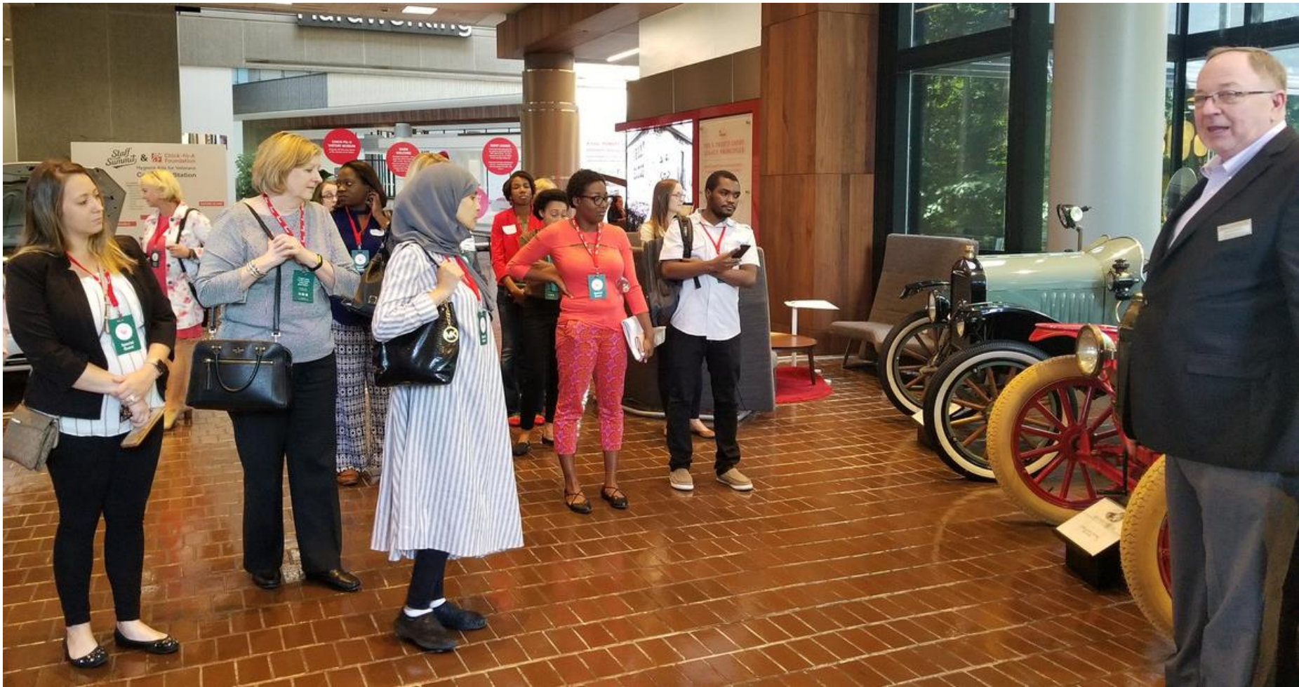
South Eastern Section IFT (SEIFT) Fall 2018 Meeting and Chick-Fil-A Backstage Tour The Chick-Fil-A Support Center, 5200 Buffington Road, Atlanta, GA 30349, on September 21, 2018