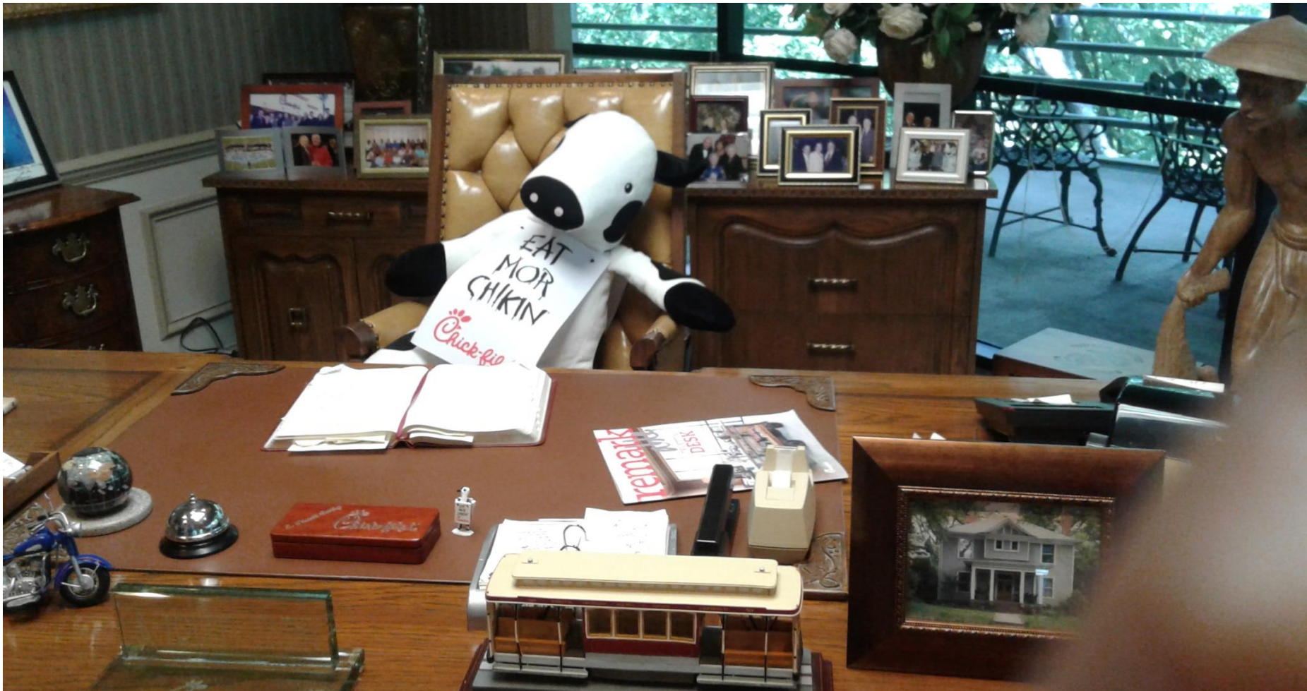
South Eastern Section IFT (SEIFT) Fall 2018 Meeting and Chick-Fil-A Backstage Tour The Chick-Fil-A Support Center, 5200 Buffington Road, Atlanta, GA 30349, on September 21, 2018