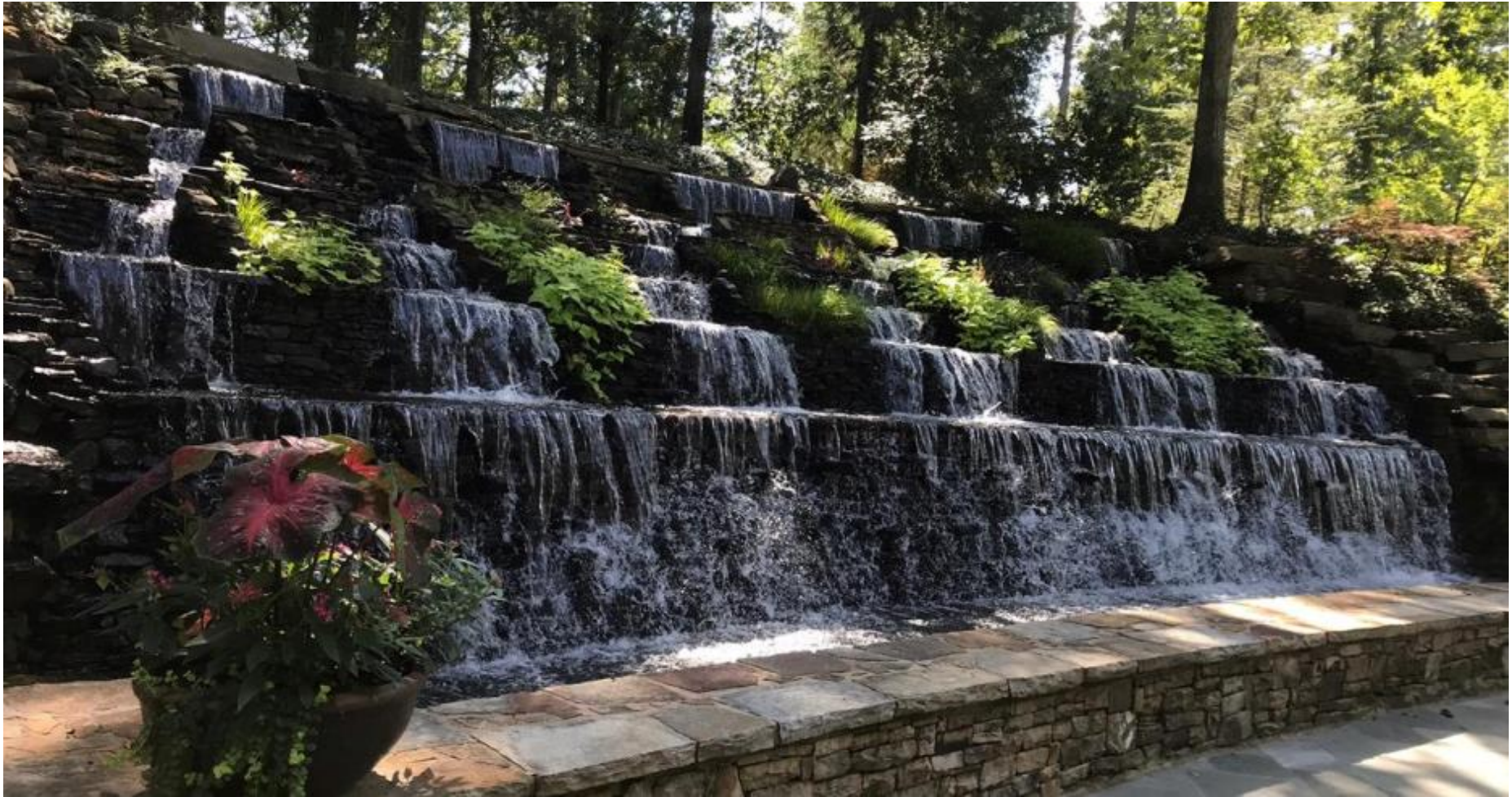
South Eastern Section IFT (SEIFT) Fall 2018 Meeting and Chick-Fil-A Backstage Tour The Chick-Fil-A Support Center, 5200 Buffington Road, Atlanta, GA 30349, on September 21, 2018