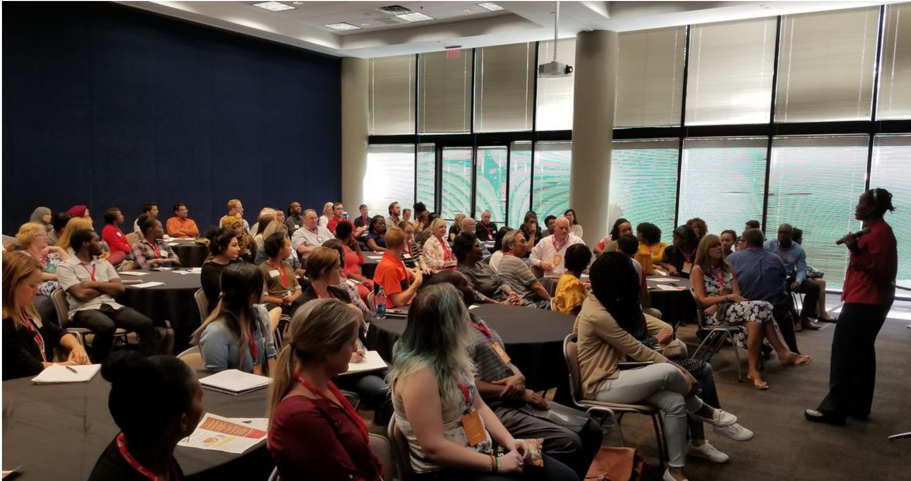
South Eastern Section IFT (SEIFT) Fall 2018 Meeting and Chick-Fil-A Backstage Tour The Chick-Fil-A Support Center, 5200 Buffington Road, Atlanta, GA 30349, on September 21, 2018