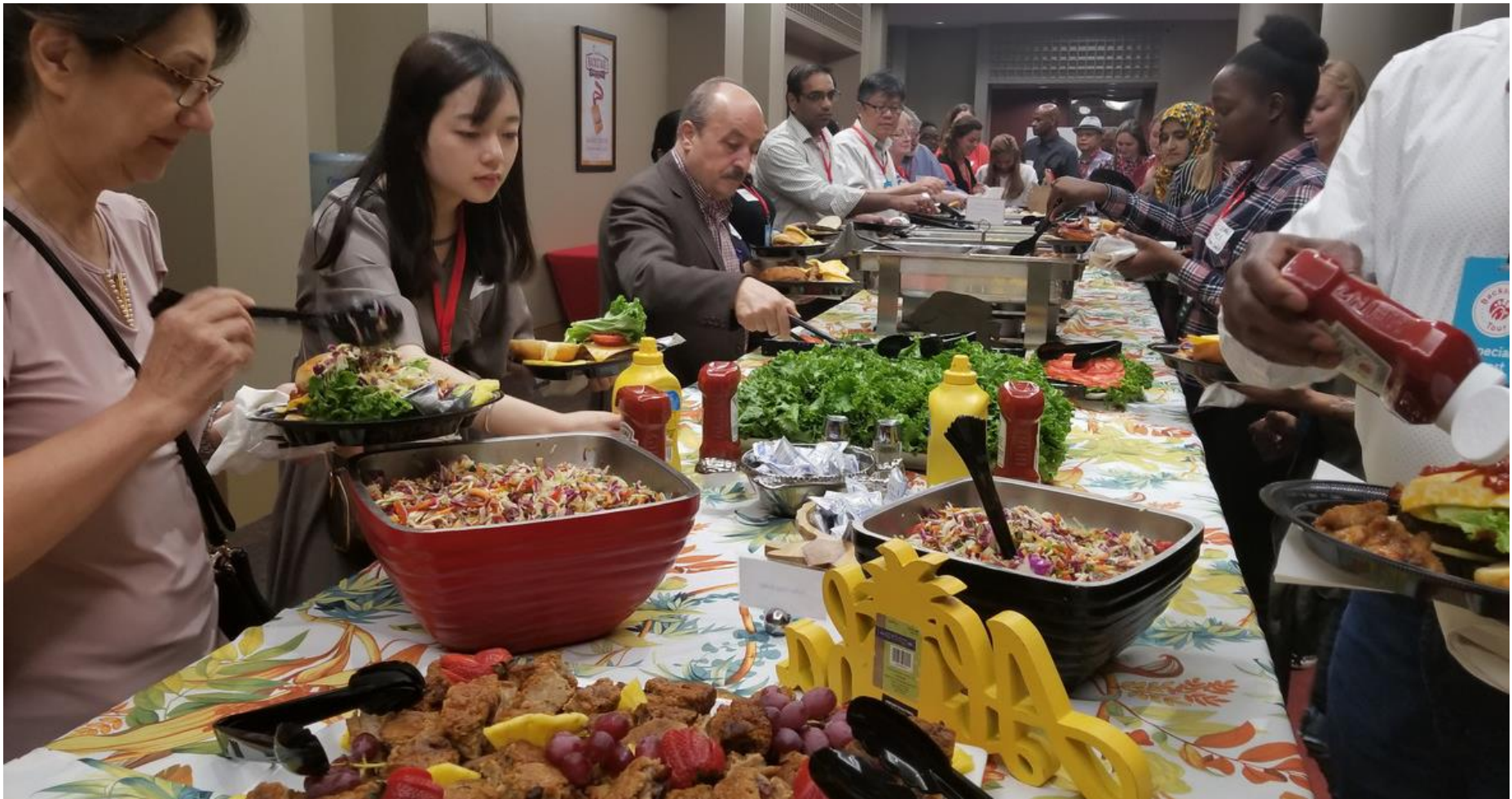
South Eastern Section IFT (SEIFT) Fall 2018 Meeting and Chick-Fil-A Backstage Tour The Chick-Fil-A Support Center, 5200 Buffington Road, Atlanta, GA 30349, on September 21, 2018