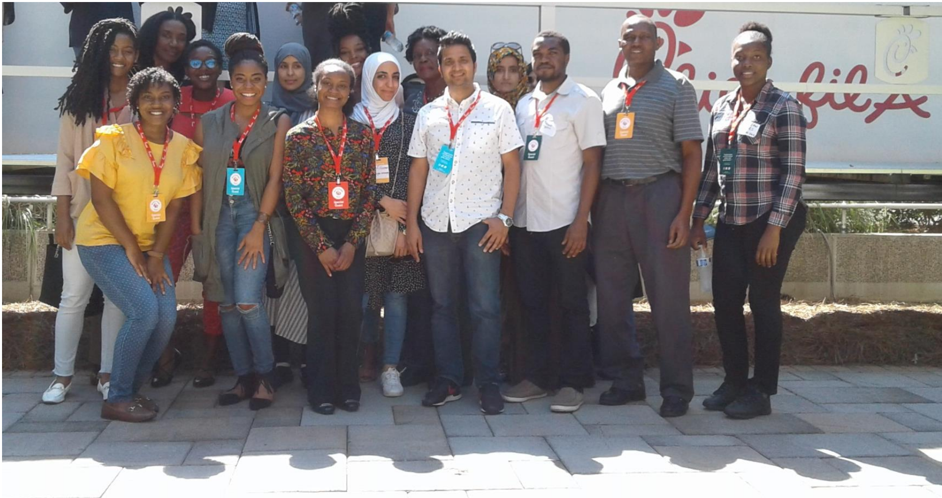
Department of Food & Nutritional Sciences (FNS) Team Attended South Eastern Section IFT (SEIFT) Fall 2018 Meeting and Chick-Fil-A Backstage Tour The Chick-Fil-A Support Center, 5200 Buffington Road, Atlanta, GA 30349, on September 21, 2018