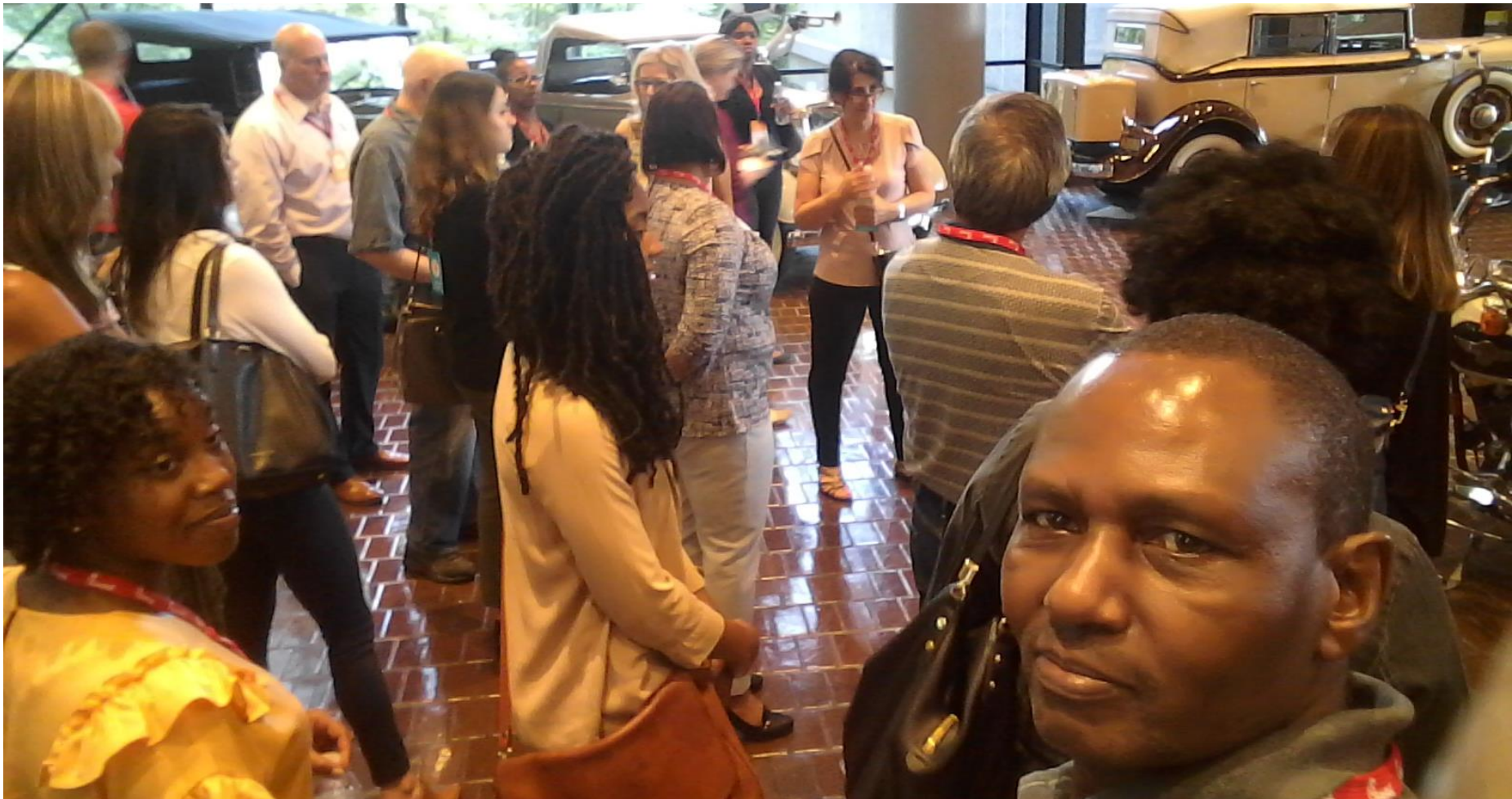
South Eastern Section IFT (SEIFT) Fall 2018 Meeting and Chick-Fil-A Backstage Tour The Chick-Fil-A Support Center, 5200 Buffington Road, Atlanta, GA 30349, on September 21, 2018