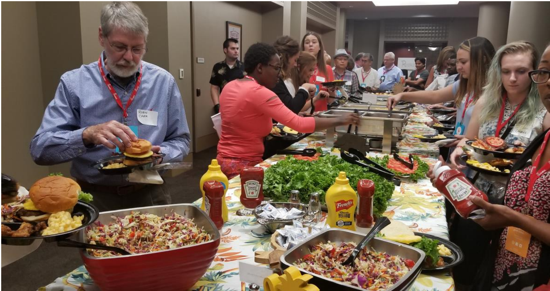
South Eastern Section IFT (SEIFT) Fall 2018 Meeting and Chick-Fil-A Backstage Tour The Chick-Fil-A Support Center, 5200 Buffington Road, Atlanta, GA 30349, on September 21, 2018