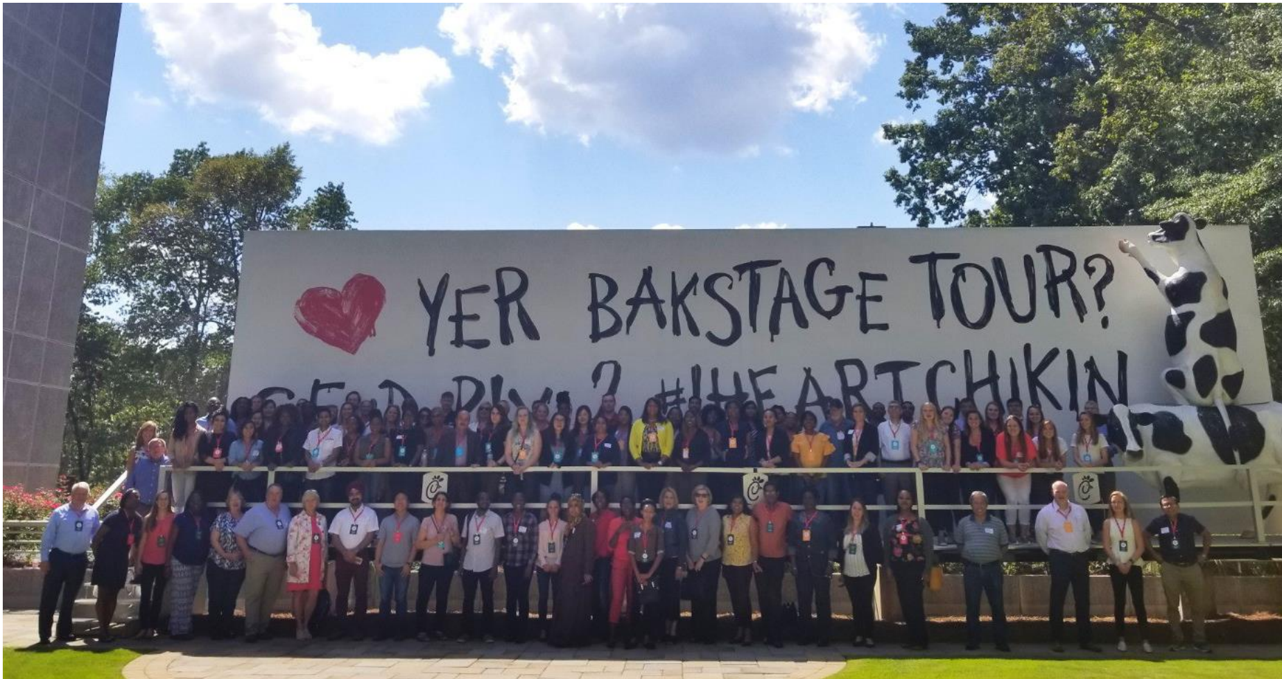
South Eastern Section IFT (SEIFT) Fall 2018 Meeting and Chick-Fil-A Backstage Tour The Chick-Fil-A Support Center, 5200 Buffington Road, Atlanta, GA 30349, on September 21, 2018