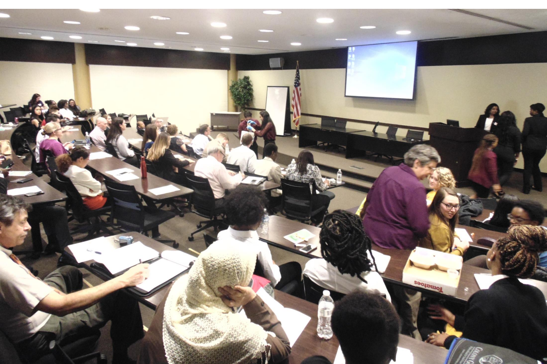
Food Product Development Competition/Presentations Institute of Food Technologists SE Section (SEIFT) Spring Meeting & Students Recognition at Clemson University on April 11, 2019