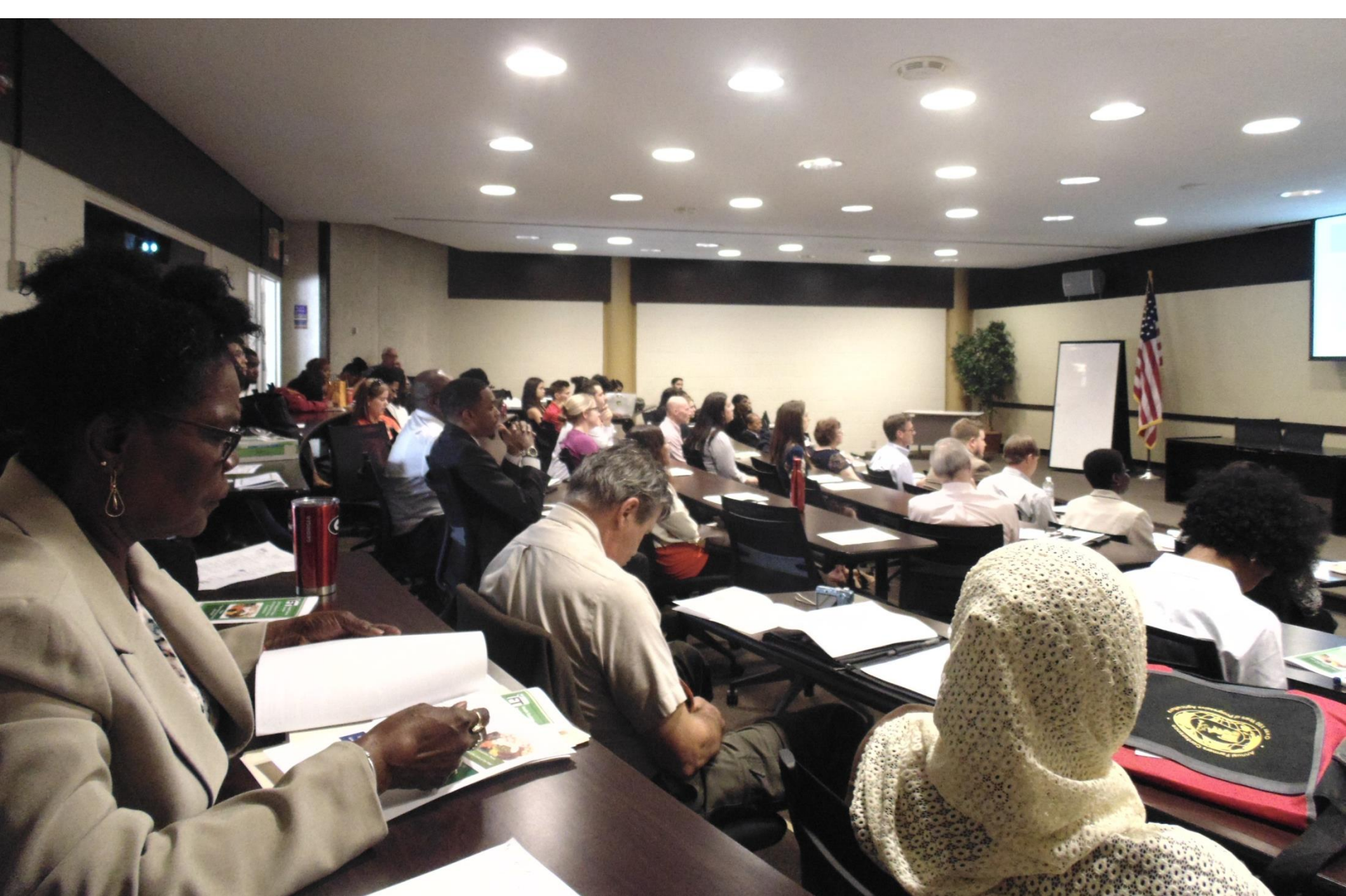
Food Product Development Competition/Presentations Institute of Food Technologists SE Section (SEIFT) Spring Meeting & Students Recognition at Clemson University on April 11, 2019