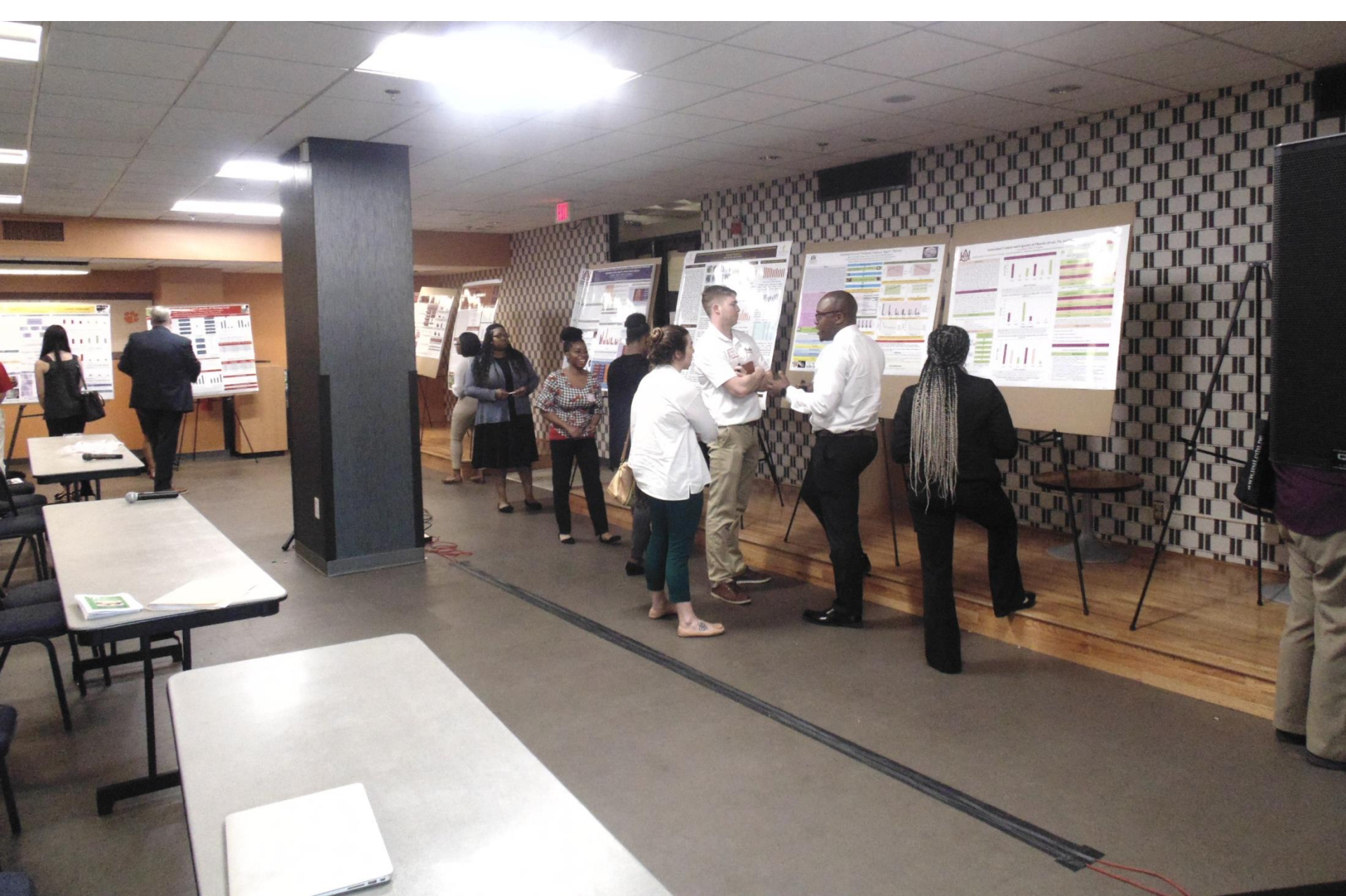
Posters Display/Presentation Institute of Food Technologists SE Section (SEIFT) Spring Meeting & Students Recognition at Clemson University on April 11, 2019