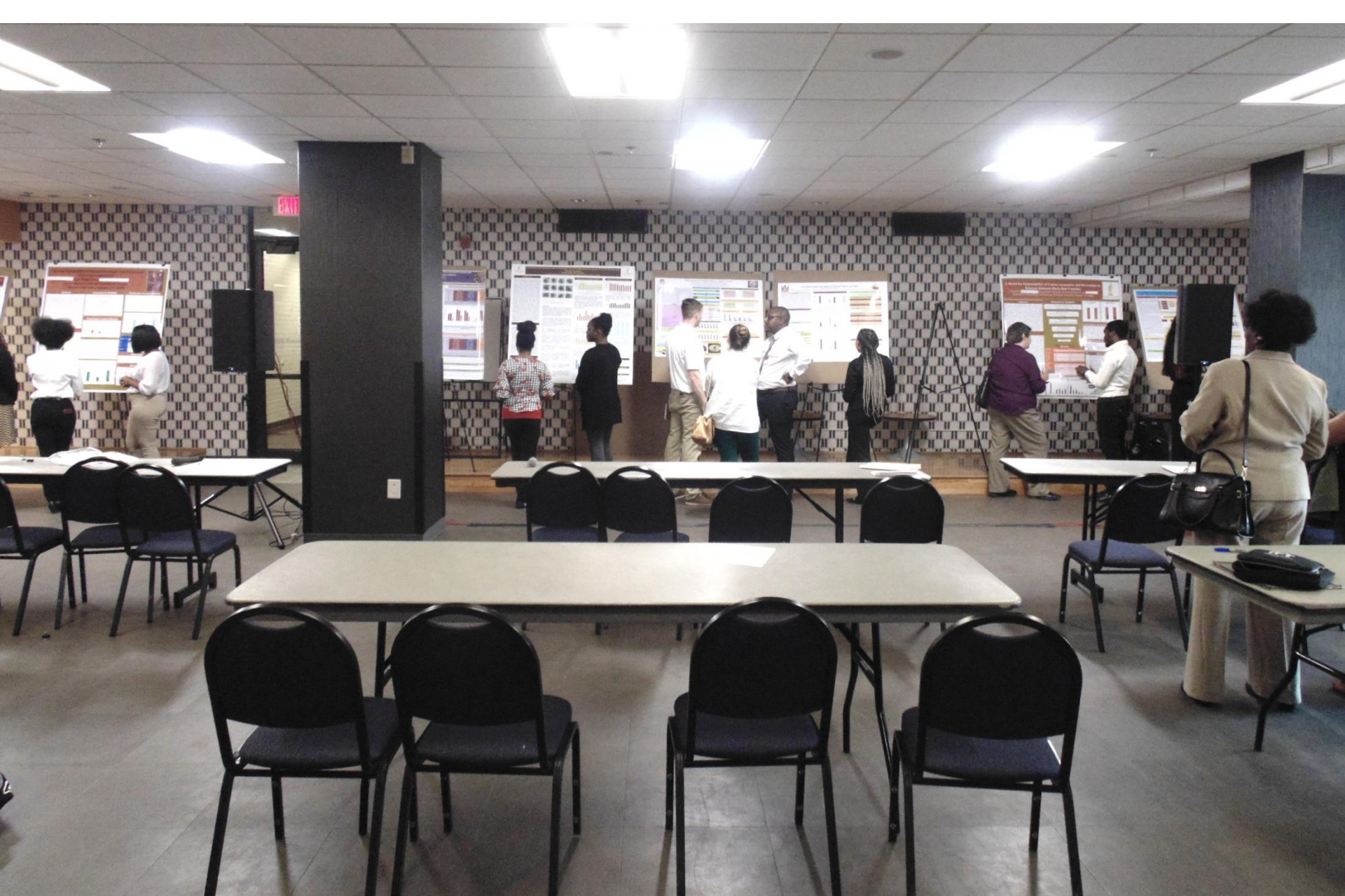
Posters Display/Presentation Institute of Food Technologists SE Section (SEIFT) Spring Meeting & Students Recognition at Clemson University on April 11, 2019