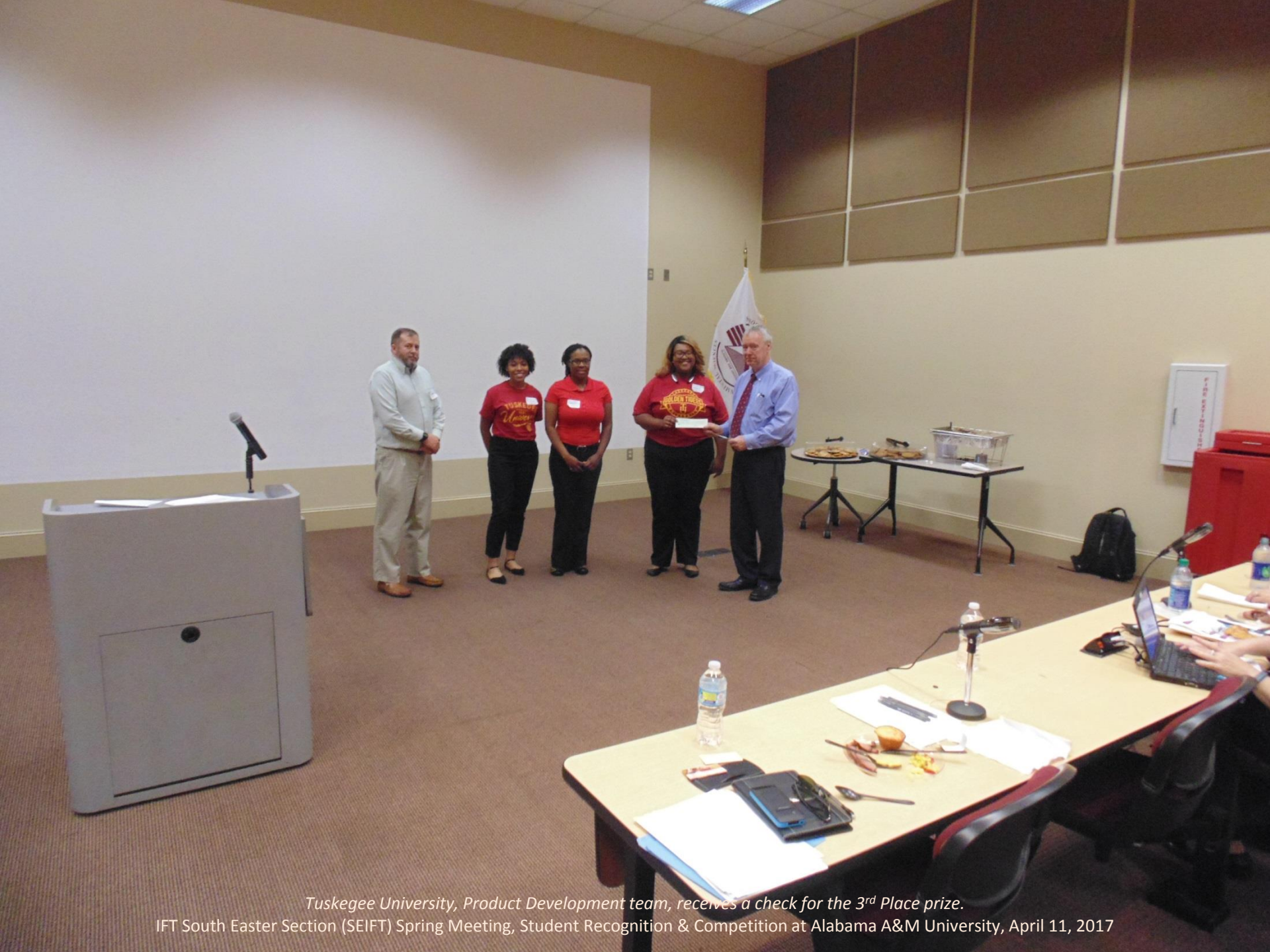
Tuskegee University, Product Development team, receives a check for the 3 rd Place prize. IFT South Easter Section (SEIFT) Spring Meeting, Student Recognition & Competition at Alabama A&M University, April 11, 2017