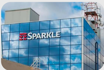
METAMORFOSIS I Built Space: 4,000 m 2 Power: 3.2 MW