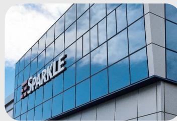
KOROPI Built Space: 2,580 m 2 Power: 2 MW