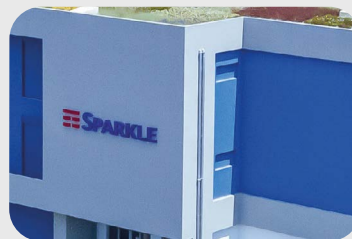
METAMORFOSIS II Built Space: 5,831 m 2 Power: 7.7 MW