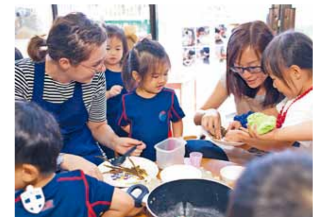
▲ Teachers engage in learning alongside children in both English and Chinese, challenging their thinking and supporting their development skills.