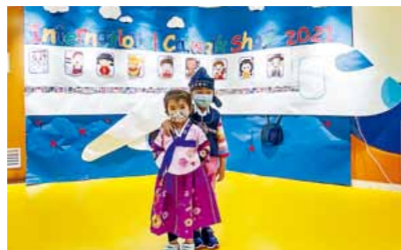
▲ International Week @ Ma On Shan Campus.

The BoxHillian Qualities is a specially curated programme that ties into their philosophy and motto of 'Confidence for a brighter future', and is interwoven throughout their curriculum from pre-nursery levels to K-3. It encompasses seven animal characters that foster key character traits that enable children to develop positive and social morals while building their interests towards lifelong learning.