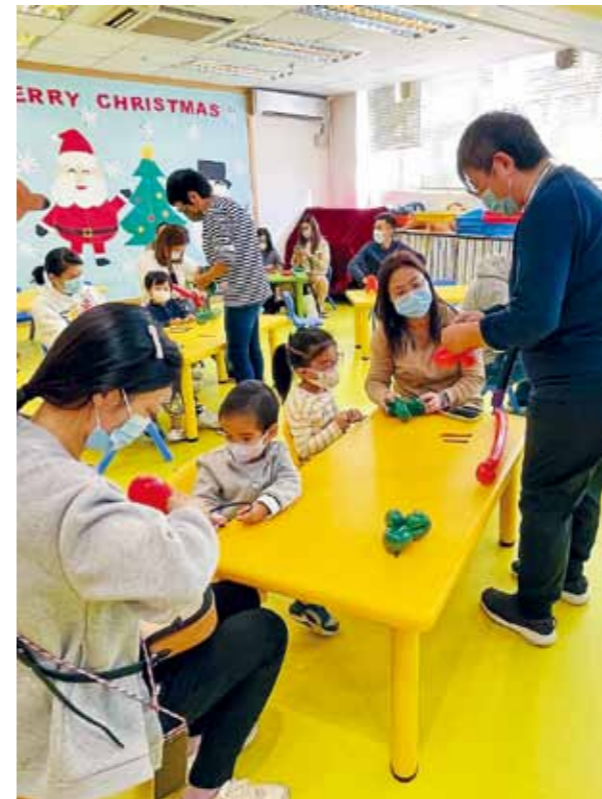
▲ Parent-child Balloon Twisting Workshop held by a student's grand parents.