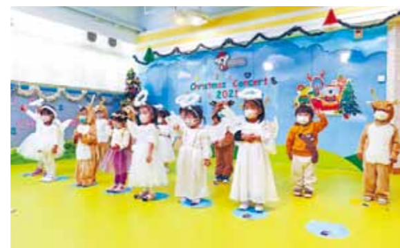
▲ Christmas Concert @ Fo Tan Campus.