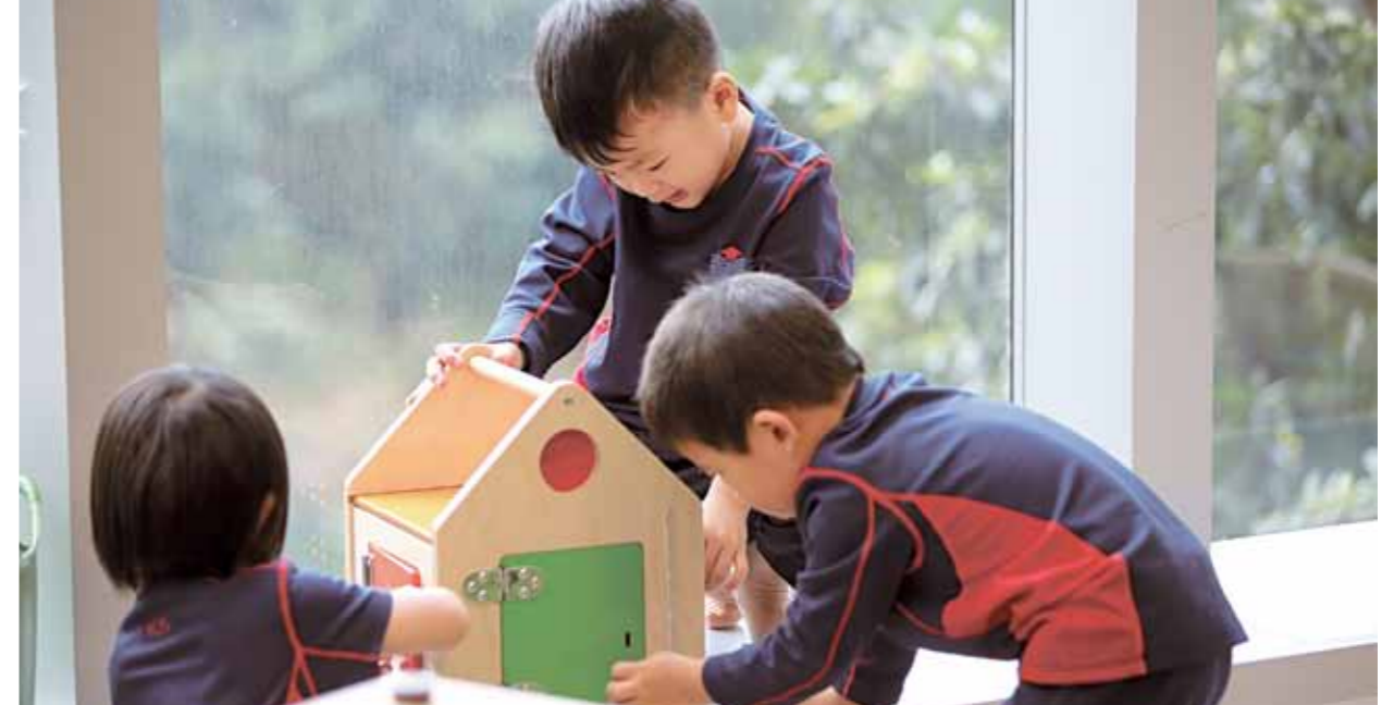
▲ Collaboration with others is an important part of learning and development in an Early Years context.

Every child is respected as a unique individual, and teachers and leaders are focused on creating opportunities and developing ways that enrich and deepen their individual strengths as well as support areas for growth.