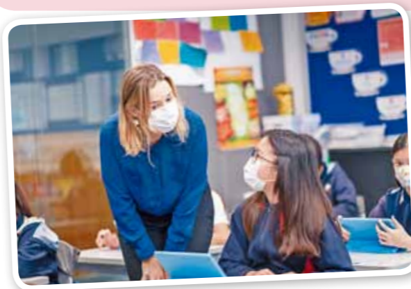
▲ Stamford teachers receive training throughout the year to deliver effective personalized learning methods into their classrooms.

Teachers use a variety of data to place students into small groups to support and challenge each individual. Scan the QR code and find out more about individualized learning at Stamford.