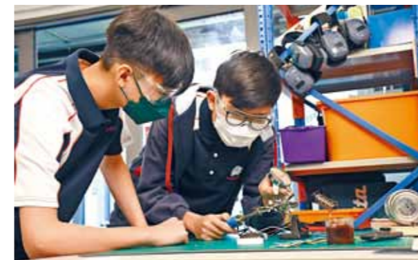
▲ IB students develop a deeper understanding of the subject through different hands-on activities and experiential learning.

Students begin their path to becoming IB learners as soon as they start school by cultivating skills and positive learning attitudes. The faculty guide students to not just achieve grades but skills as a measure of success.