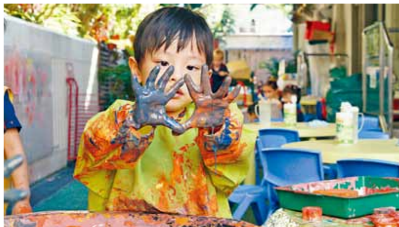
▲ Children’s curiosity and investigation are encouraged as they explore their ideas through play opportunities.

curriculum is an emphasis on the motto: ‘Development Matters’ with focus areas placed on seven domains. These include physical development, understanding the world, expressive arts and design, personal, social and emotional development as well as Mathematics and Literacy.