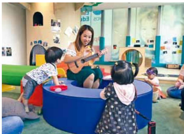
▲ Teachers use music and singing to engage children and support their auditory skills and language development from a young age.

The school follows a Chinese and English bilingual programme for all years. The Infant and Toddler Learning Programme (ITLP) and the Kindergarten Programme is guided by the developmental outcomes of the Early Years Foundation Stage of the National Curriculum of England. In line with this