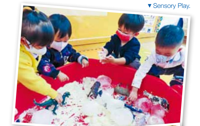
▼ Sensory Play.

Box Hill will be holding Digital Open Day for their 3 campuses on June 4. Parents are welcome to register via the Box Hill website. Upon entering the address, guests will receive a complimentary artwork pack for a fun activity with their children along with a storytelling video. Take part in school tours and a presentation by their School Principal and School Development Specialist for more in-depth information. There will also be a live Demo Lesson for young children by their experienced Early Childhood Education teachers involving Music and Movement. Register: bit.ly/3wjKtAr