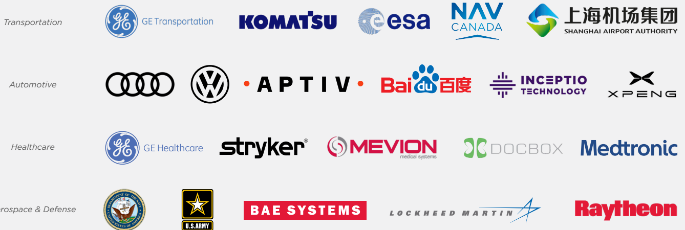
To manage complex communications on land, by air, underwater and in outer space, these organizations rely on RTI Connex

The Reconfigurable Virtual Collective Training System (RVCTS) incorporates the latest mixed reality technology to deliver the highest immersive fidelity of any collective training system. By leveraging Connex in their RVCTS, Kratos can ensure reliable backend communication among hardware and software real-time systems. Kratos’ RVCTS has subsequently been deployed under real-world conditions as the UH-IMP-AVET Mixed Reality trainer.