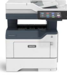
Xerox® VersaLink® B415 Multifunction Printer