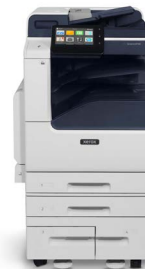
Xerox® VersaLink® B7125/B7130/ B7135 Multifunction Printer