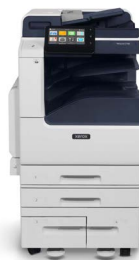
Xerox® VersaLink® C7120/C7125/ C7130 Colour Multifunction Printer