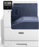
Xerox® VersaLink® C7000 Colour Printer