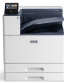
Xerox® VersaLink® C8000 Colour Printer