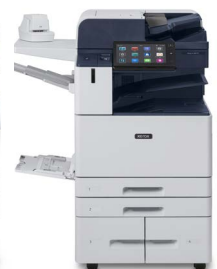
Xerox® AltaLink® B8145/B8155/ B8170 Multifunction Printer

* Product not available in all geographies, please consult with your sales representative.