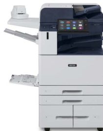
Xerox® AltaLink® C8130/C8135/ C8145/C8155/ C8170 Colour Multifunction Printer