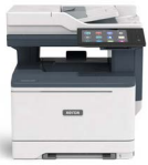
Xerox® VersaLink® C415 Colour Multifunction Printer