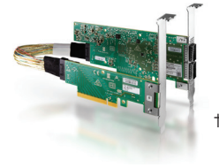
Mellanox Socket Direct Adapter Card