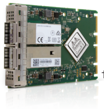
OCP3.0 Adapter Card