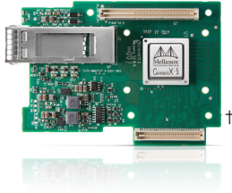
OCP2.0 Adapter Card