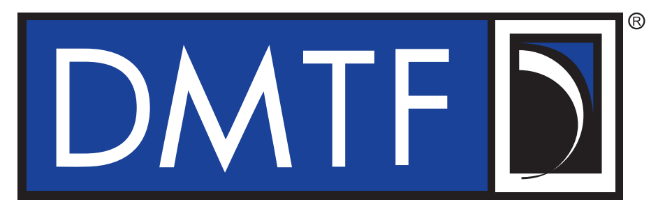
Figure 1 – DMTF color logo