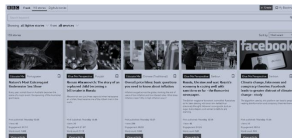
Figure 2: BBC's Frank Multilingual Prototype

BBC has implemented some of the GoURMET models in three prototypes, including its multilingual MT prototype Frank 3 .