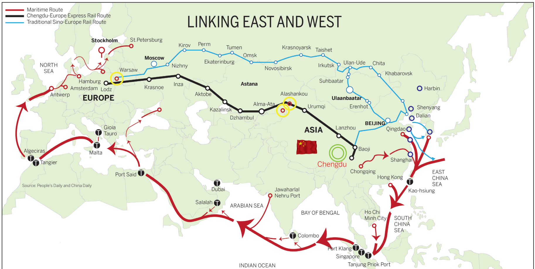
The two cargo train routes linked to Europe and Central Asia make Chengdu an important hub for land transportation.