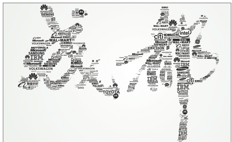
The characters for "Chengdu" made up of the logos of multinational companies. The city is home to operations by 262 Fortune 500 corporations.

Local officials said that the modern industries and leisure business in the new area will help create an "industrialized Chengdu".