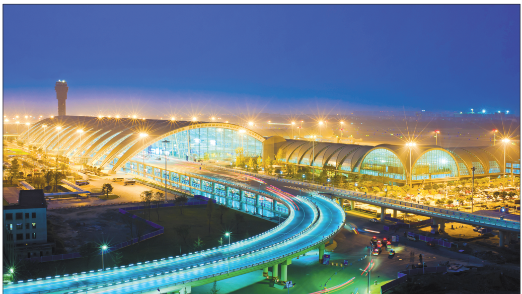
Serving 78 international passenger and cargo routes and handling 37.5 million travelers a year, Chengdu Shuangliu International Airport is the aviation hub in western China.