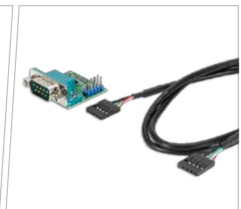
ASUS Serial Port Extension Card