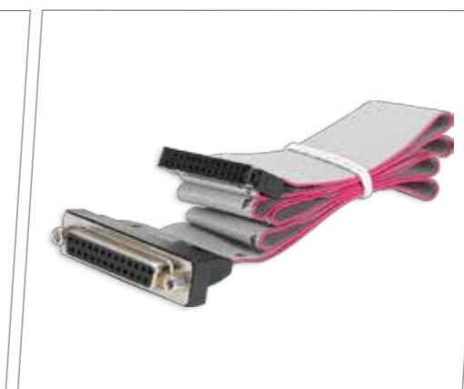
ASUS Parallel Port Cable