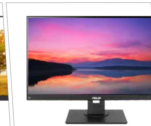
ASUS 27" Business Monitor (BE279CLB)