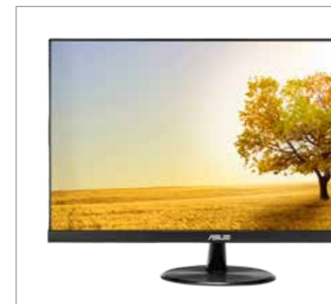
Asus 27" Eye Care Monitor (VP279N)