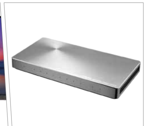
Hyper-Fast Networking (XG-U2008)