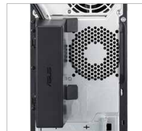
ASUS Back I/O Protector