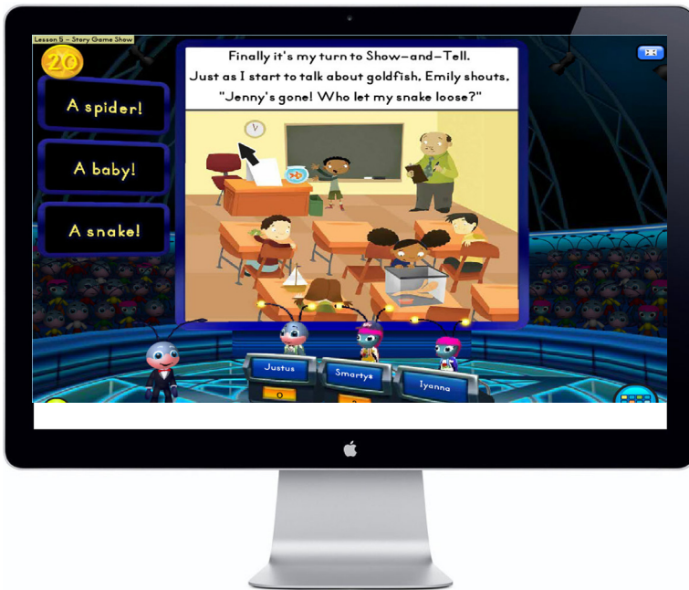
Figure 4 – In Story Game Show, questions about the stories provide clues to early reading comprehension skills.

In Smarty Ants, the Story Game Show, which is accessible after completing a variety of games on the activity board, is the main site of reading comprehension activities. A variety of questions asked in a game show format allow the child to demonstrate mastery of a library of stories. Metacognitive thinking strategies are modeled throughout, both by the host of the show and the ant friends that the child invites to play along and react to the story (Harvey & Goudvis, 2007).