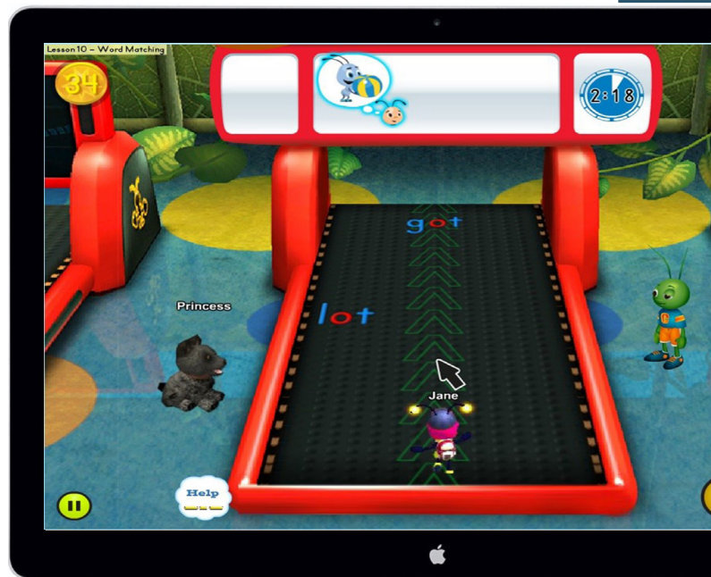
Figure 2 – An ant on the Treadmill learning letter-sound associations.

If the child gets the letter wrong, he or she is provided assistance and instruction. The transition is seamless in the games, as children then interact with the learning cloud videos that teach the sounds of the letters, often involving the inflating of letter-shaped balloons.