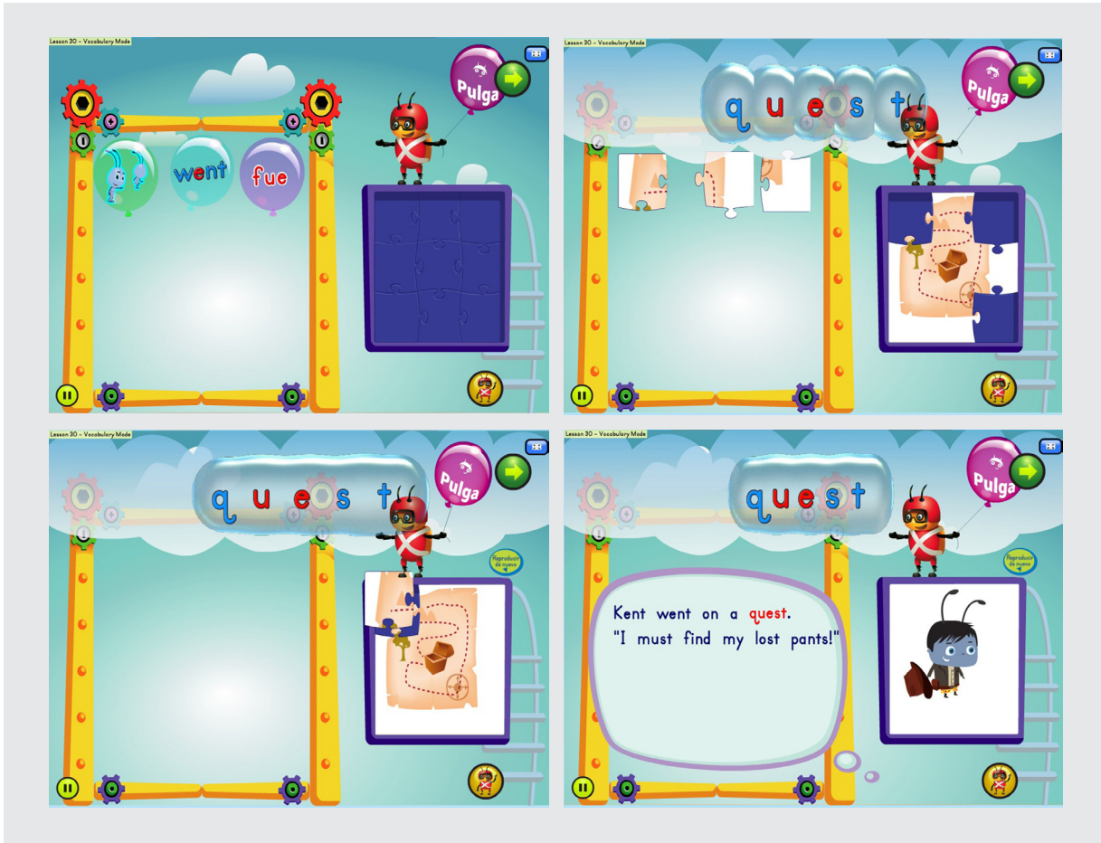
Figure 5 – Children play an English vocabulary game at the beginning of each of the 67 story lessons in the dual-language version of Smarty Ants.

dual-language instruction is desired. For these children, the program also includes an additional vocabulary pre-teaching module in every lesson, so that children will more effectively learn new vocabulary in the context of their native language and English.