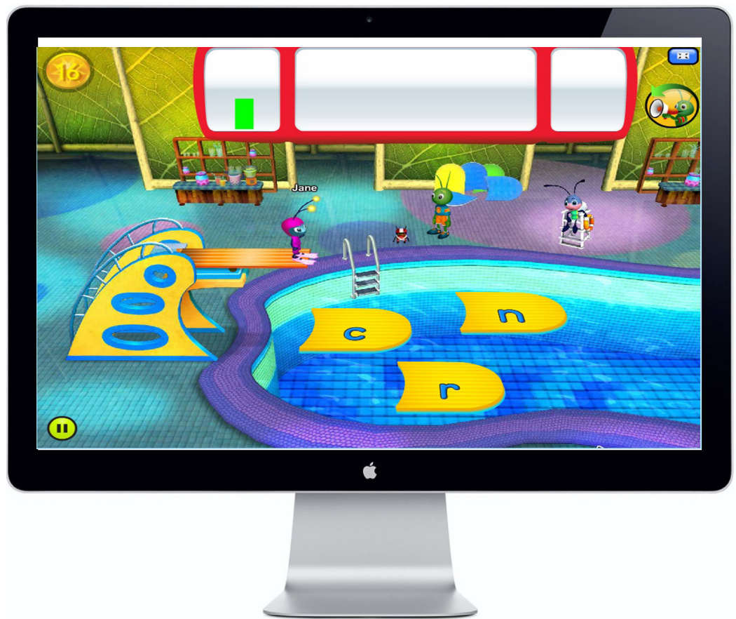
Figure 1 – The Assessment Pool is where each child is initially assessed for placement in the appropriately leveled learning environment.

Critical reviews of reading research, such as the one conducted by MacArthur, Ferretti, Okolo, and Cavalier (2001), highlight how technology can potentially teach phonological awareness and decoding skills, especially now that many software programs teach letter-sound correspondences and allow for the manipulation of sounds in words. This is of critical importance, considering that one of the main stumbling blocks that children experience in developing their reading abilities is based on the simple concept that words are composed of both immutable and malleable components that, depending on their arrangements, create new words. Lessons 3-69 in Smarty Ants have children watching and participating in the creation of words from sounds. This occurs concurrently with the teaching of sound-letter correspondences.