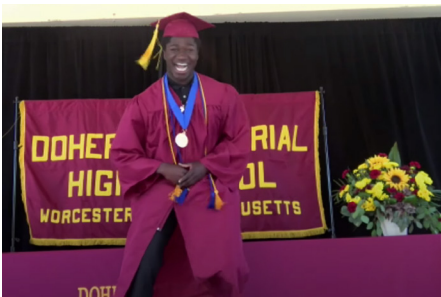
High school senior celebrates during virtual ceremony