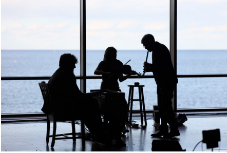
Virtual Christmas Celtic Sojourn , Shalin Liu Performance Center, Rockport