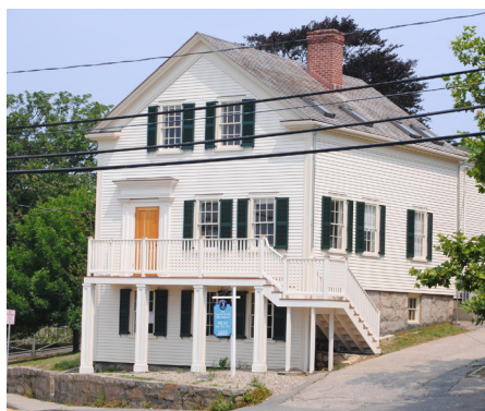
CAI's building in Woods Hole

CAI, a service of GBH, celebrated its 20th anniversary of providing listeners on Cape Cod, Nantucket, Martha's Vineyard and the South Coast with their own NPR station – one infused with a unique local sound and sense of place. CAI's feature reporting covered topics ranging from COVID-19, homelessness on Cape Cod, the impact of climate change on the Cape's environment and much more. Partnerships with the Cape Cod Times and the area's weekly papers enrich the station's robust news reporting. In 2020, the station won a second-place award from the Outdoor Writers Association of America 2020 Excellence in Craft for "Winter Clamming Digs Up Many Rewards."