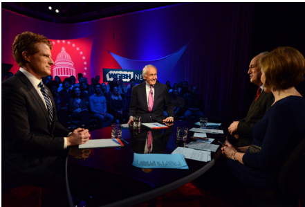
Kennedy-Markey Senate primary debate