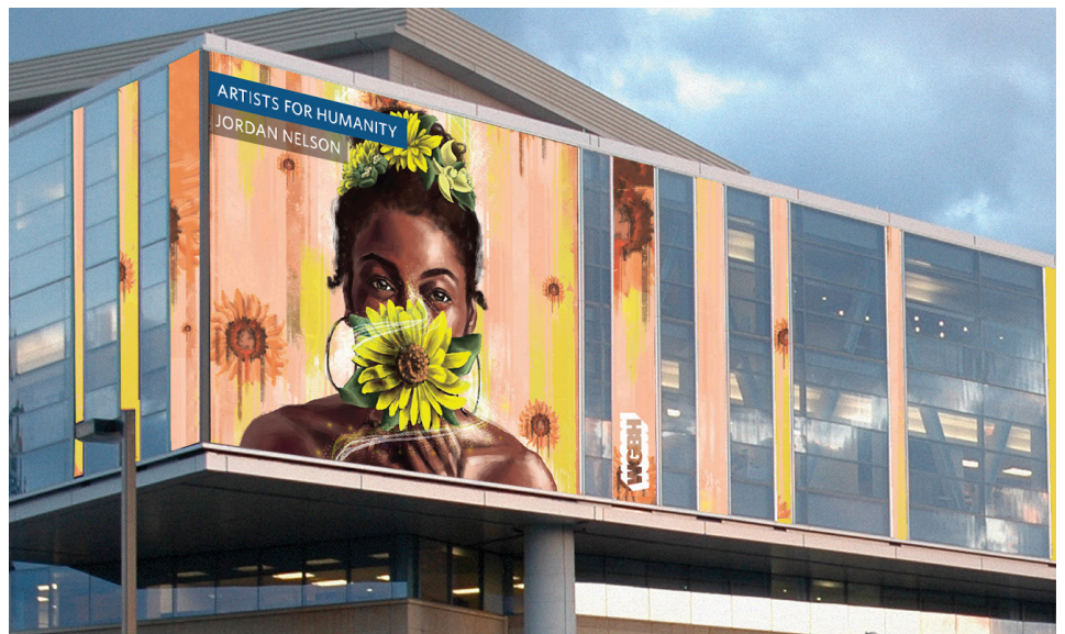
GBH mural featuring local artists

A 30-by-45 foot LED screen alongside GBH Studios signals the spirit and content of public media for thousands of passersby each week, with one theme a day showcased through photography or slow-moving images. The digital mural mirrors the vibrancy of our region: images reflecting events and issues in our community and nation are displayed drawing attention to the cultural richness of Boston and New England and to what's on the minds of those in the neighborhoods we serve. Features in 2020 included tributes to first responders and other health care and essential workers, Boston's Children's Hospital, Boston Symphony Orchestra on CRB Classical 99.5, local Artists for Humanity and the 150th anniversary of the Museum of Fine Arts.