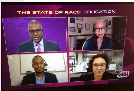
The State of Race panel