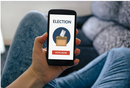
Apps make voting more accessible.