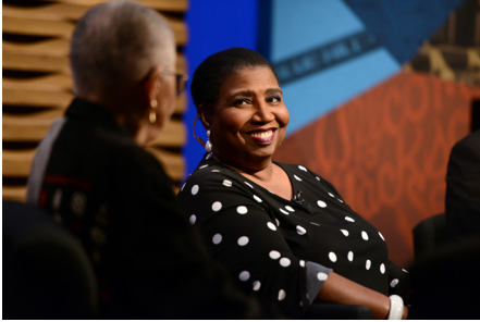
Callie Crossley

food groups' needs during COVID-19, underrepresentation of women in STEM, Massachusetts ballot questions, serving breakfast in schools and Massachusetts' distracted driving bill.