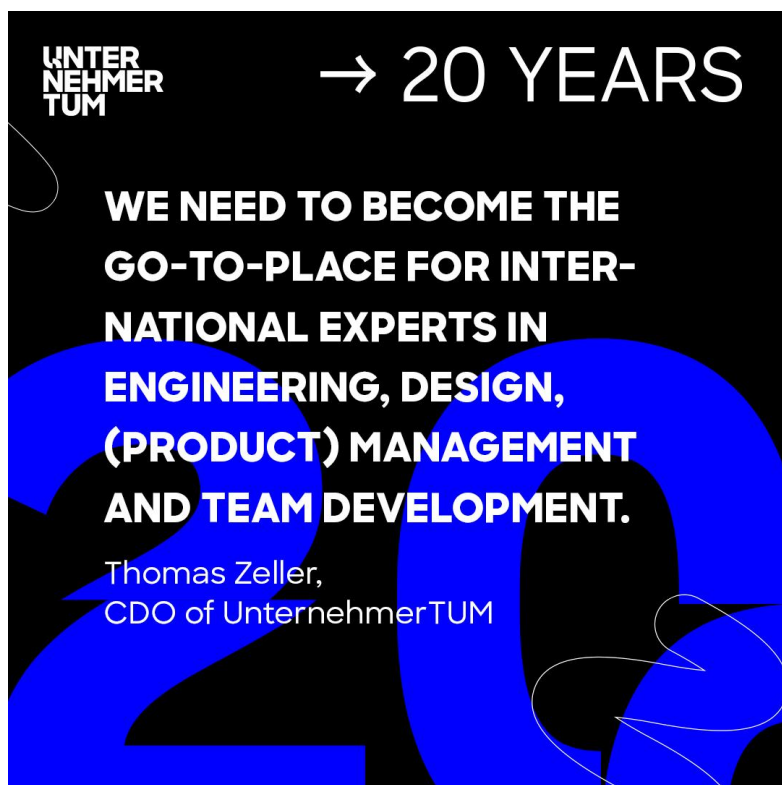
Template 5 - personal quote