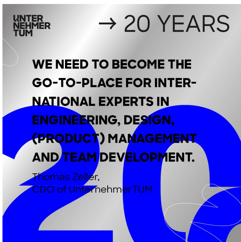
Template 6 - personal quote