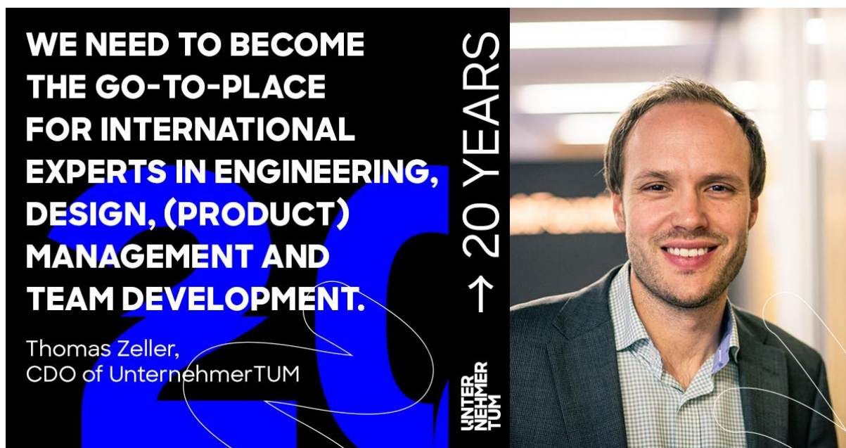
Template 1 - personal quote and photo