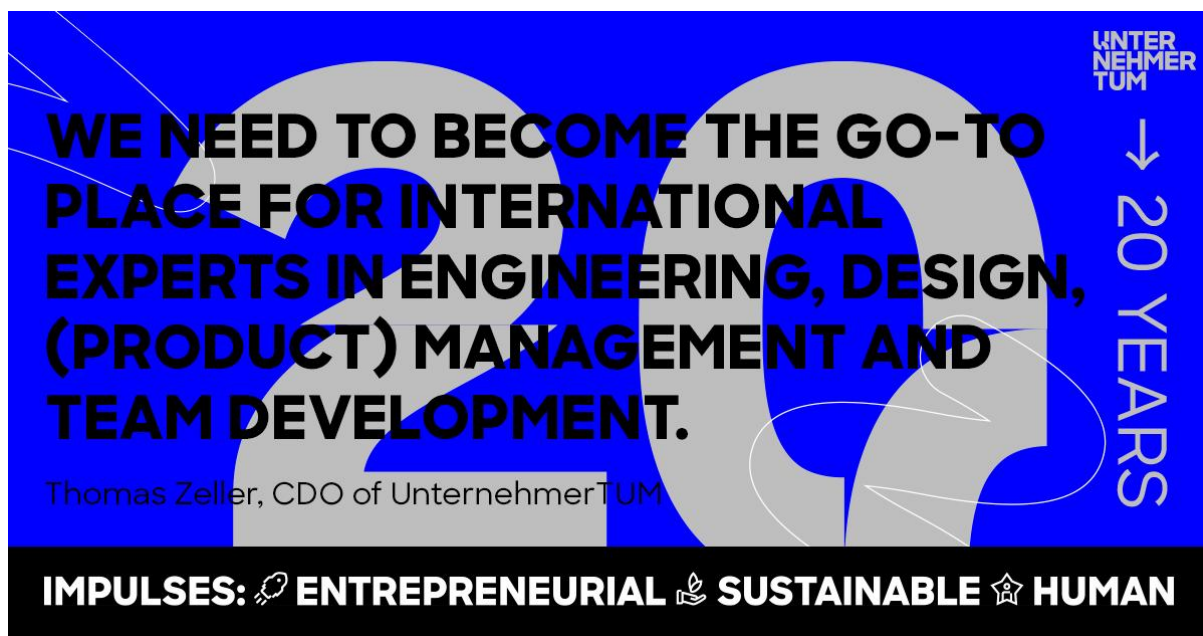
Template 2 - personal quote