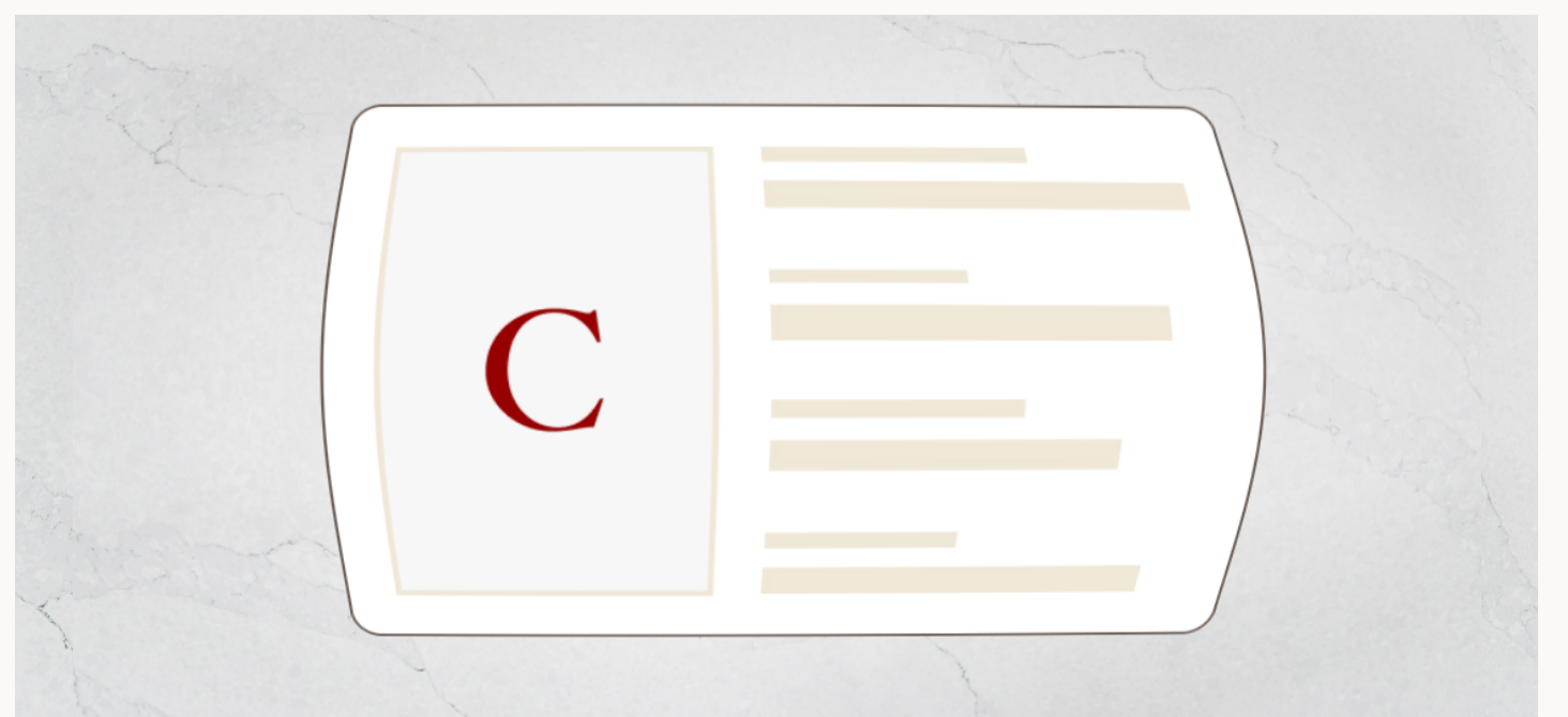
Filter or lens issues