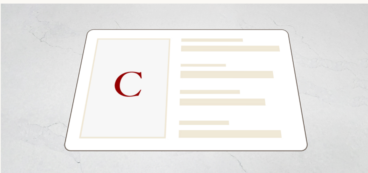
Skewed or angled image