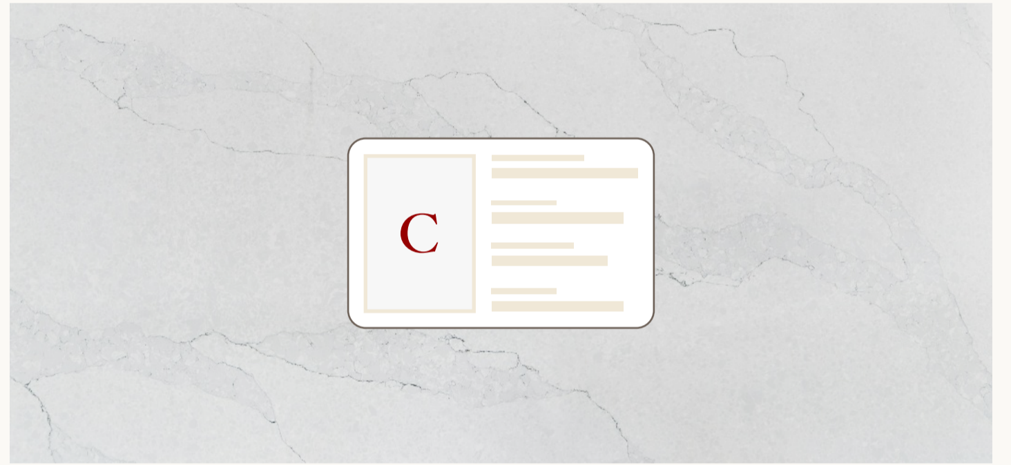
Small image or low resolution