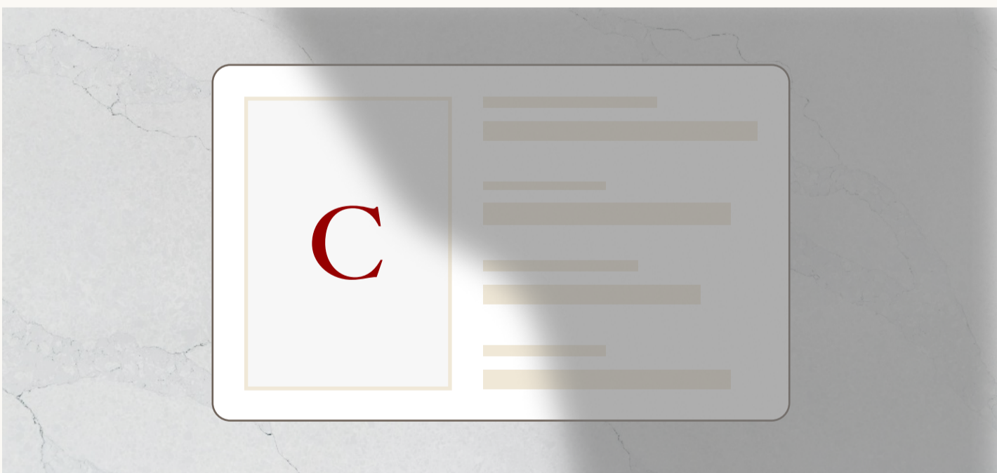
Bad light or shadows