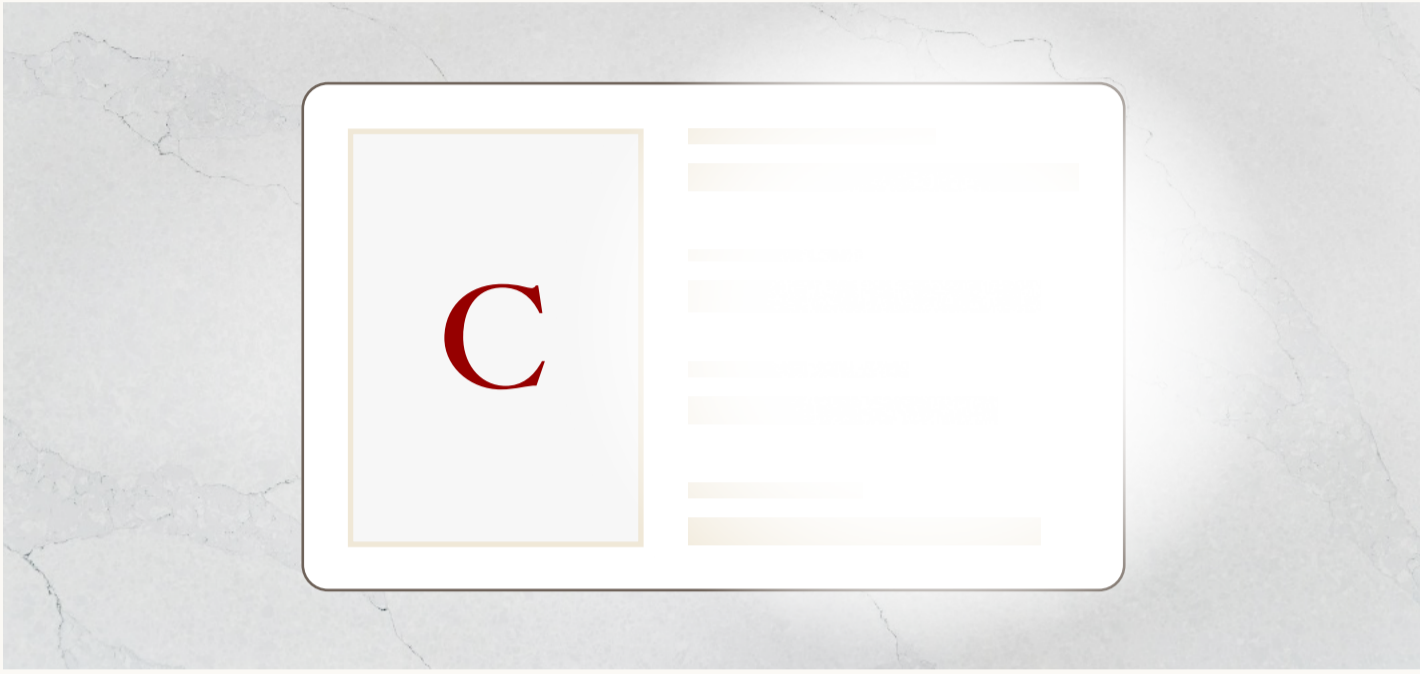
Glare & reflections