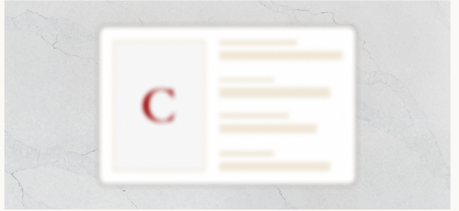
Out of focus/blur