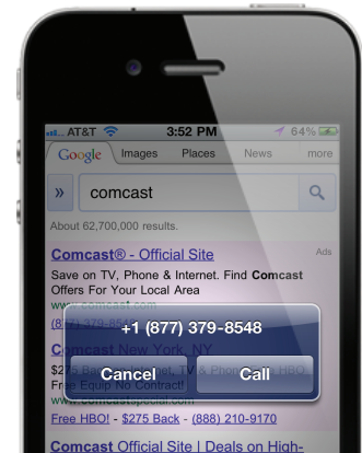
Mobile search ad

Comcast launched a mobile search ad campaign driven by top keywords and created mobile-optimized sites for all of its products. The search campaign engaged users searching for Comcast keywords and directed them to mobile-optimized sites where users could complete an order, check service availability nearest their location, and click-to-call for assistance, all activities that especially made sense for mobile. Comcast also implemented a mobile ad extension that allowed users to call Comcast directly from the search results page on their phone.