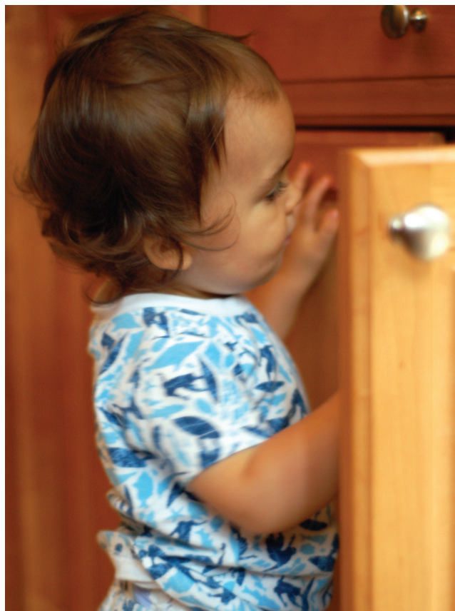
Figure 3. Installing childproof latches on cabinets can prevent children from opening them and possibly ingesting dangerous chemicals.

The most frequent misuse is accidental swallowing by curious children (Figure 3). Therefore, never transfer cleaners into soft drink bottles or other containers that may seem harmless to children. Keep cleaning