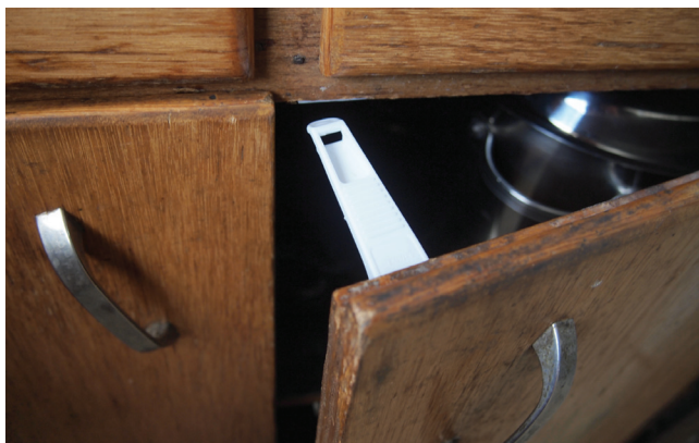
Figure 4. A childproof safety latch on a cabinet door.

hold the valve open until all the contents and gas have escaped.