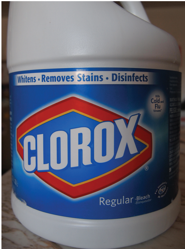
Figure 1. A bottle of commercially available liquid chlorine bleach.

Chlorine bleach is one of the most widely available and affordable disinfectants on earth. Liquid chlorine bleach (Figure 1) is an alkaline solution of sodium hypochlorite dissolved in water. It is a base and is especially good at removing stains and dyes from textiles. Additionally, chlorine bleaches are used for controlling mold and mildew and for disinfecting surfaces.