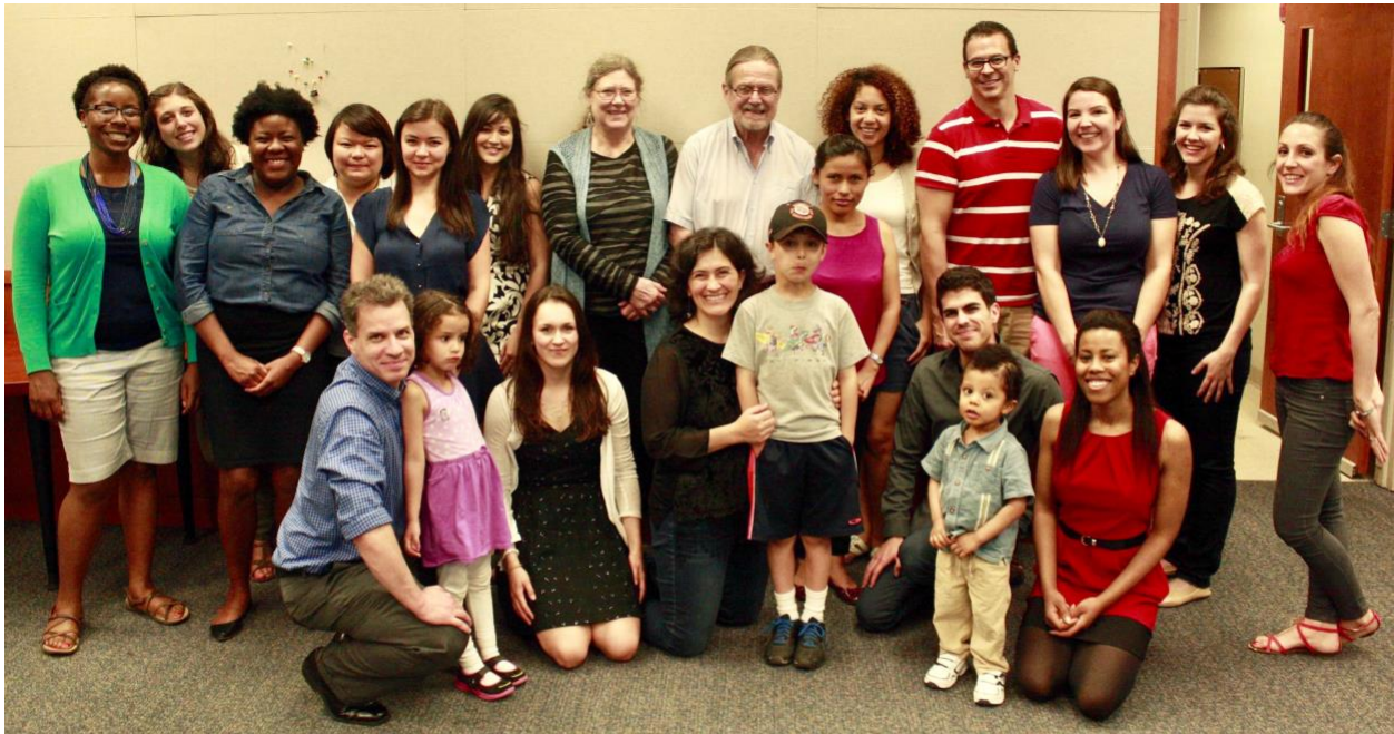
An INCC gathering in 2015