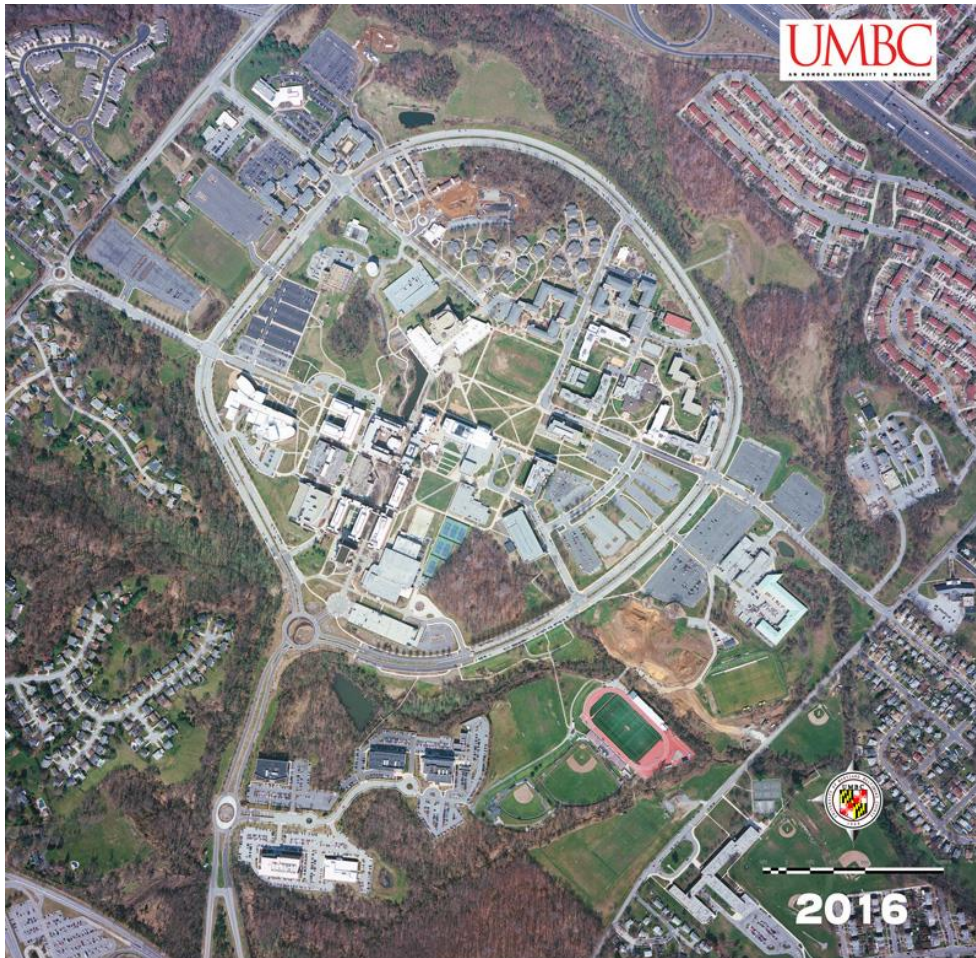
Aerial View of the Campus in 2016