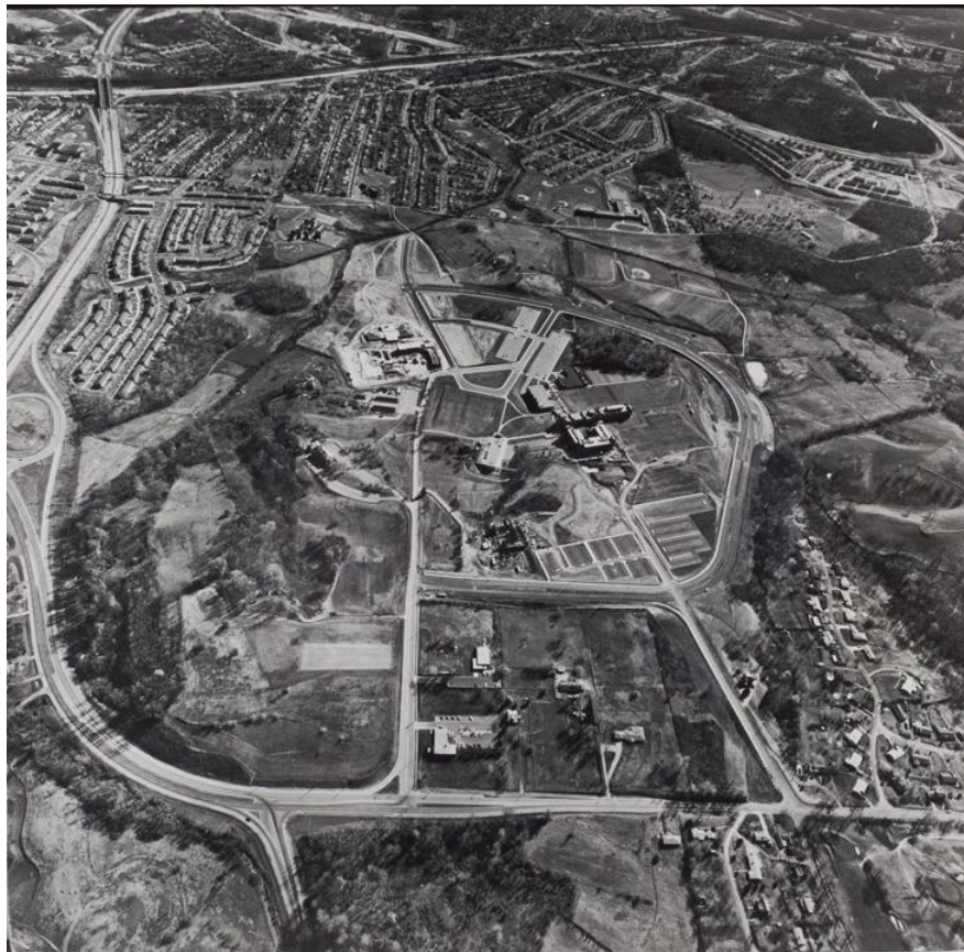
UMBC in 1999