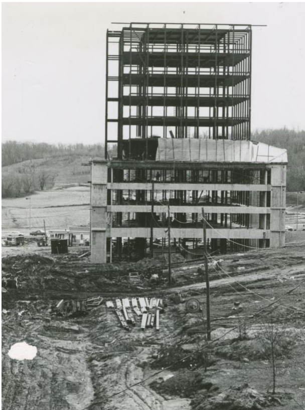
Continual Construction. The Administration Building in 1969

In 1971 the long post-World War II economic boom ended, and public university budgets throughout the country, like those of other areas in the domestic public sphere, were threatened. In Maryland, programs with a relatively small number of majors were scrutinized. With separate