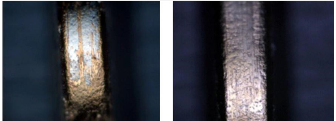
Figure 2. A failing (left) and passing (right) result from the standard socket wear testing procedure.

This same level of materials analysis was used during our conversion to BFR (brominated flame retardant) and PVC (polyvinyl chloride) free systems 1 . The Z by HP R&D team did not treat all available unrestricted materials as acceptable options. We engaged in a thorough analysis of the new materials that would need to be used on motherboards, in cases, and in connectors to ensure that the BFR/PVC free materials met our reliability and performance expectations. The result of this analysis was materials that exceeded our expectations in almost every category of mechanical and electrical reliability and performance, while producing a product with a reduced environmental impact. 2