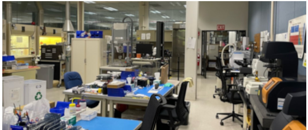
Figure 1. The HP Workstations Materials Science Lab, a state of the art facility used to test workstation products beyond standard industry practices.

Poor materials and processes used commonly in the industry will produce designs that are subject to premature failure. Our analysis, specifications, and selection processes drive designs using above-standard quality components. One example of this is memory sockets. Each socket comprises hundreds of contacts whose material interface,