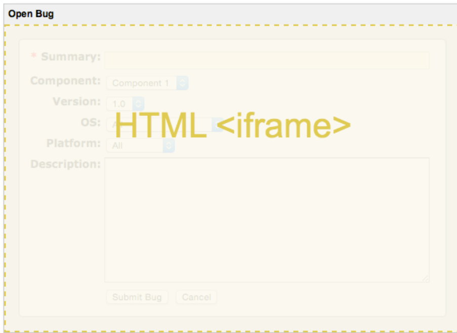
Fig. 2 Dialog iframe

Clients might choose to place dialogs inside page elements styled to look like a dialog window.