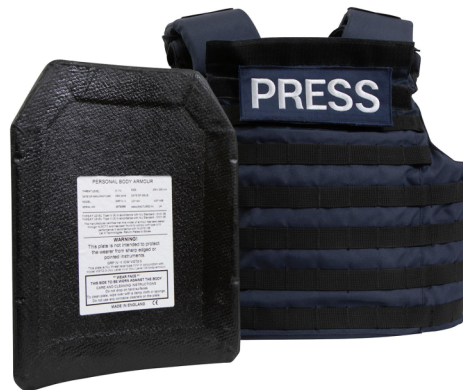
A ballistic hard plate insert made from ceramic.