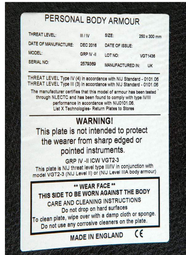
Safety information on a ballistic hard plate made from ceramic.