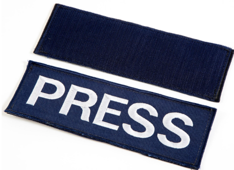
Velcro PRESS badges can be added or removed as necessary.