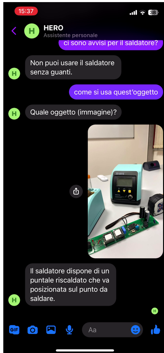
Figure 4: The figure shows a conversation with HERO using a chat where text signal have been retrieved by a speech to text module. Note that to disambiguate the worker’s question, an image has been sent to the artificial assistant representing the object for which support has been asked.

This manuscript presented technologies developed by NEXT VISION - Spin-off of the University of Catania.