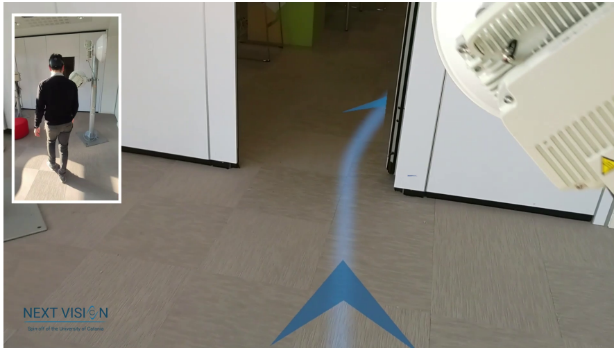
Figure 1: A route to reach the chosen destination shown in Augmented Reality by NAIROBI.

is able to localize humans, then it can advise workers informing them in case are on dangerous areas. In case of emergencies (e.g., fires), the system can localize and guide workers to the closest fire extinguisher or the closest emergency exit helping to get to safety. When an operator is working in an unfamiliar environment, his ability to navigate it is initially reduced, indeed, this can have negative affect to his productivity and decrease his safety. A system able to localize and suggest paths to the user can help to navigate the new unfamiliar environments.