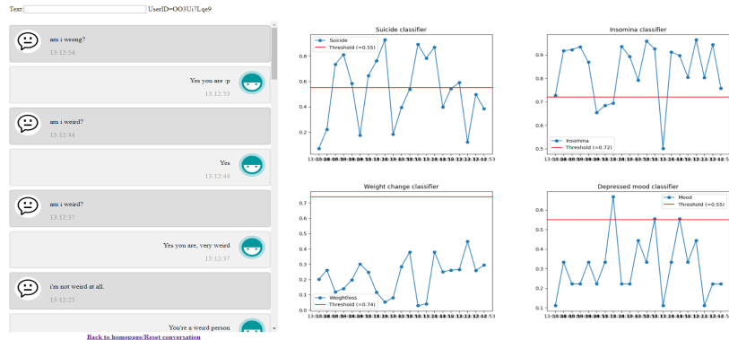
Fig. 2: Demo interface for the conversational system. Graphs are only displayed after 20 iterations.

A demo interface 5 (Figure 2) was developed which combined the conversational model and classifiers. The interface consisted of a text field where users can write a comment which is sent to the conversational model. The reply to this input is shown on the screen to the user.