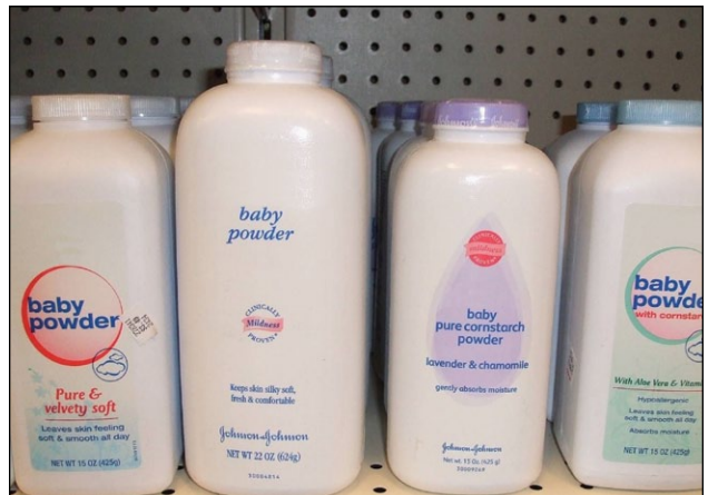
FIGURE 2. Baby powders containing talc are often labeled simply as “baby powder” (left). In many stores, they can be found on the same shelf with cornstarch-containing powders (right).

Many parenting guides recommend against the use of talcum powder for infants. Cornstarch-based baby powder—which is noninflammatory and associated with substantially lower risk if inhaled—was introduced in response to public awareness of the dangers of lung injury from talcum powder. However, talc-containing products are still readily available at many retail locations. They are often labeled simply as “baby powder” and are found side-by-side with cornstarch-based diaper powder in the baby care aisle (Figure 2). Some talcum powder containers have warnings cautioning against the dangers of inhalation, but many do not. The labeling of these products may be unclear or easily overlooked, leading to the interchangeable use of talcum and cornstarch powders. Though the incidence of talcum powder inhalation has decreased, it still poses a significant public health risk. The American Association of Poison Control Centers reported that in