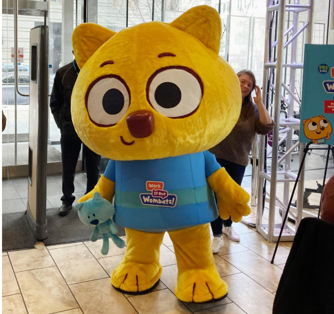
Zeke tours downtown Boston as Work It Out Wombats! debuts.