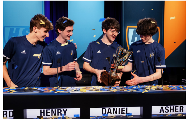
Buckingham Browne & Nichols School won 2023’s High School Quiz Show.