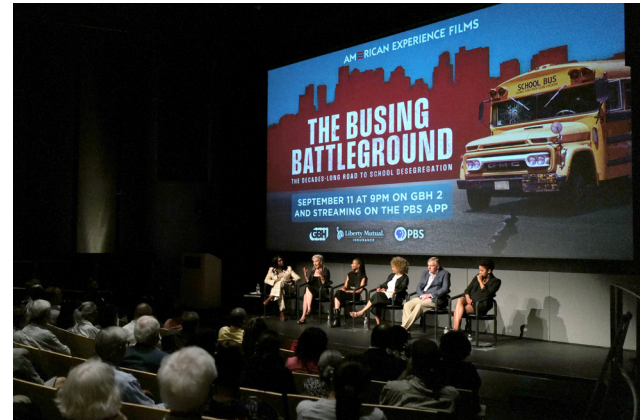
GBH held community events to launch AMERICAN EXPERIENCE’s The Busing Battleground , which examined the busing crisis in Boston.