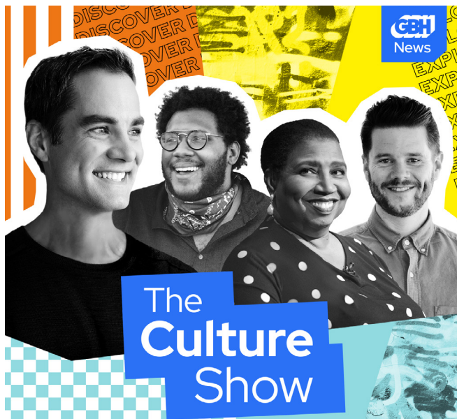
A new program, The Culture Show , features local and regional arts and culture coverage every weekday on GBH 89.7.