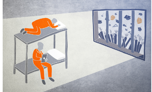
GBH News' Life After Prison explores the experiences of Massachusetts residents who return from incarceration.