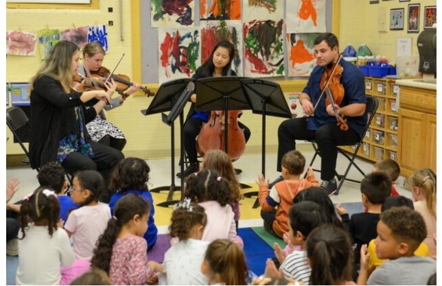
The Ulysses Quartet, GBH’s first quartet in residence, performs at the Edison K8 school in Brighton.