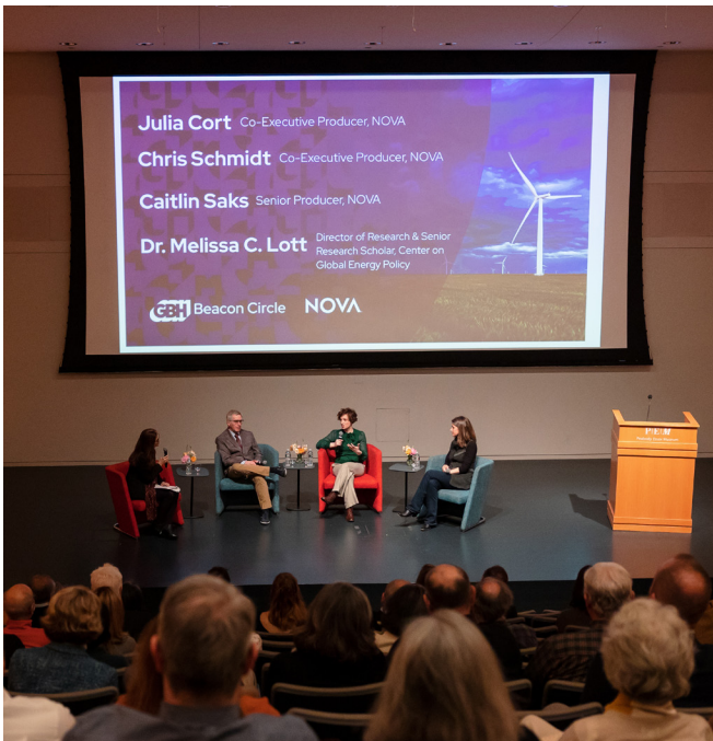
GBH's NOVA team participated in a climate change forum at PEM.