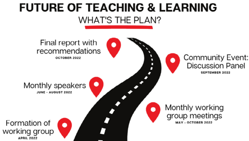
Figure 1. Roadmap for the Future of Teaching and Learning Working Group

We convened as a Working Group in April 2022 and met virtually every month between May and October 2022 (Figure 1).