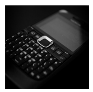
Question: What is on the phone screen? Answer: A text message from a friend.

In addition to image captioning, hallucination has also been observed in other VL tasks and raised as an open research question. For example, in open-ended visual question answering, Figure 3 (left and right) shows that the model could generate seem likely answers when we only see the text, however wrong when given the image. Moreover, Figure 3 (middle) indicates that hallucination can also be triggered by adversarially prompting an unanswerable question. The model will imagine an unsupported answer that commonly matches the given visual scene.