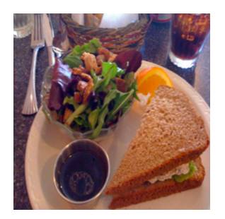
Question: What can you see out the window? Answer: A parking lot.