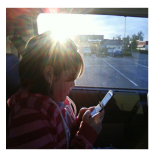
Question: Whom is the person texting? Answer: The driver .

Fig. 3. Examples of hallucination in visual question answering (taken from [3]). The bold text is the output generated by the model and the part before it is the input prompt.