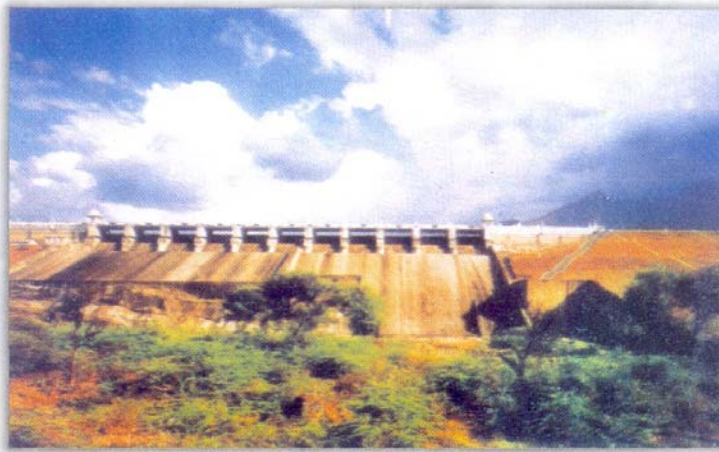
Aliyar Dam (Tamil Nadu)