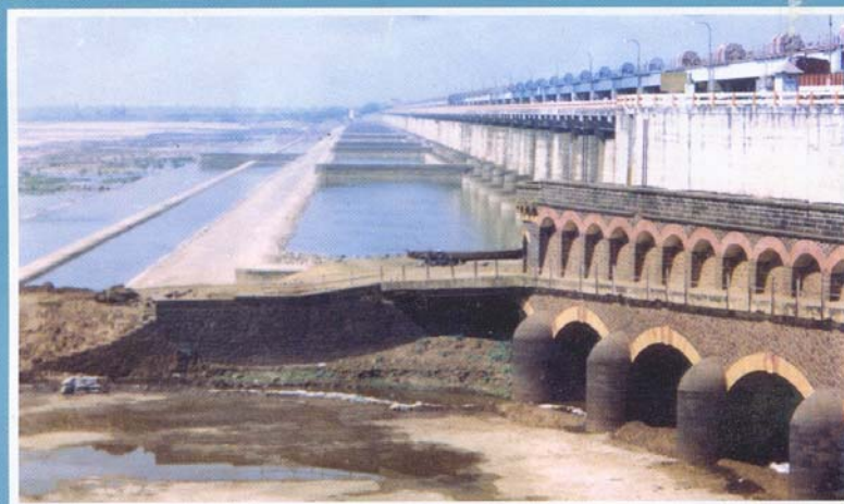
Down stream view of Dowlaiswaram arm of the Sir Arthur Cotton's barrage (Andhra Pradesh)