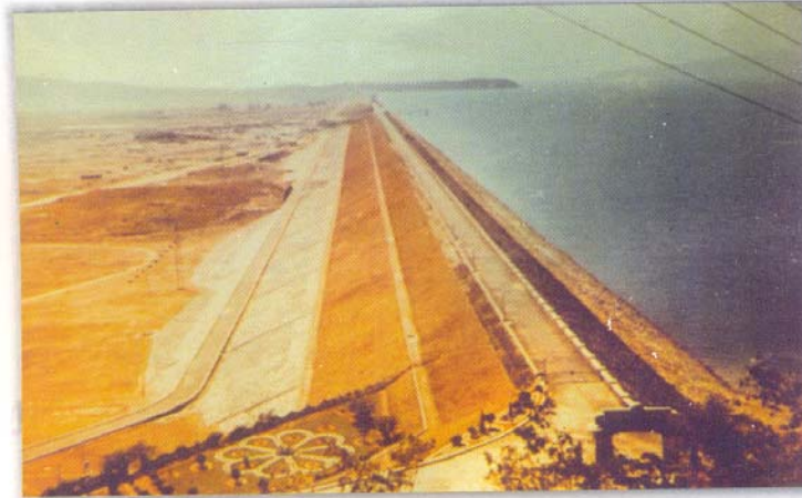
Hirakud Dam (Orissa)