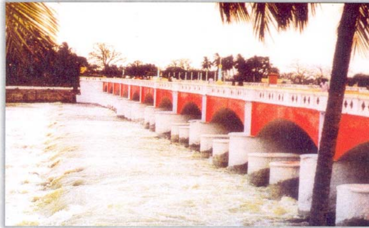
Grand Anicut (Tamil Nadu)