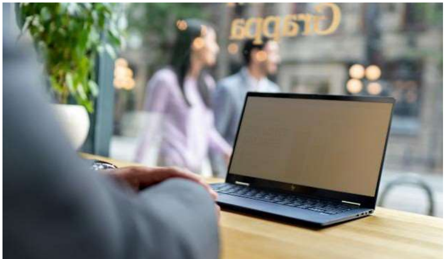
Figure 4. HP Sure View Reflect copper-tinted privacy experience.

HP Sure View Reflect uses proprietary reflective technology to reflect the light in the environment, obscuring the screen when viewed at an angle. This provides an improved privacy experience in light and dark environments.