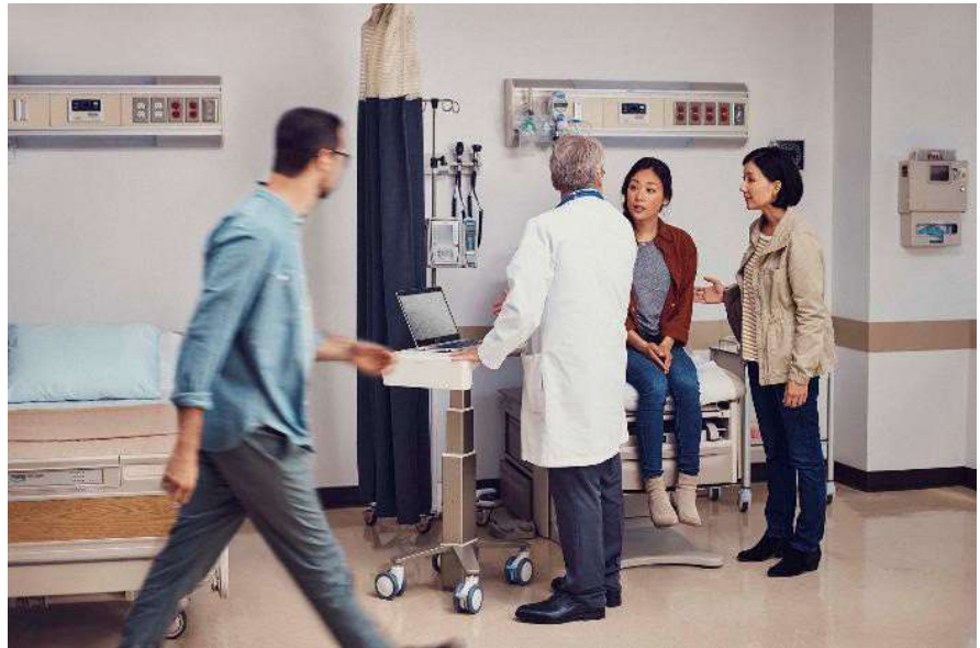
Figure 2. HP Sure View Gen2 bright white privacy experience.

HP Sure View Gen2 provided a marked improvement from Gen1, by improving the privacy experience, and simplifying the feature activation with a single, pre-programmed function key. When privacy mode is activated on Gen2, the screen contrast is reduced off-axis to obscure the on-screen image. This provides a bright white privacy experience.