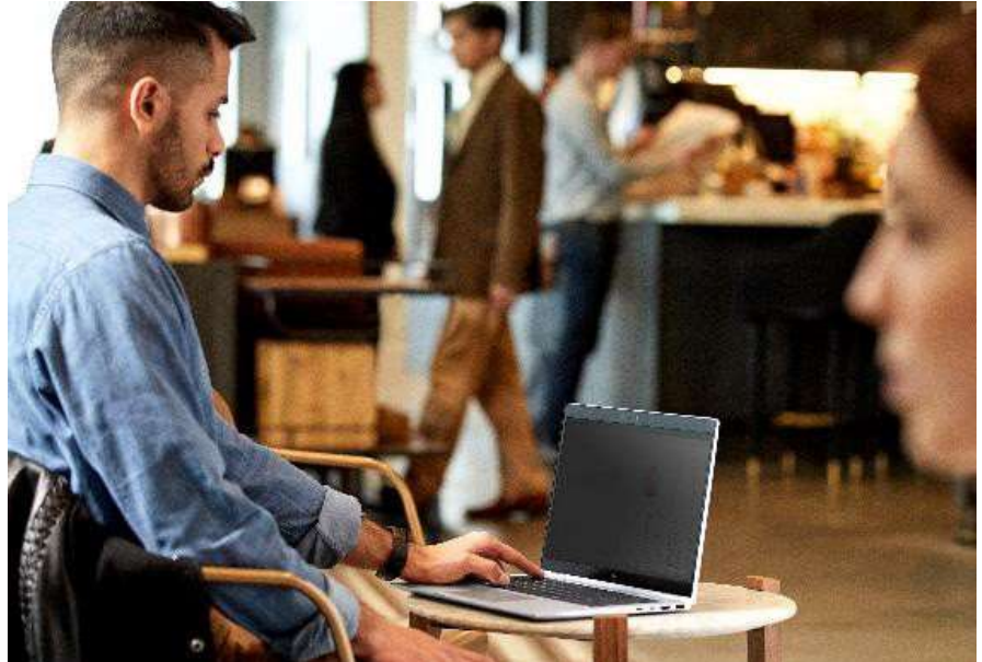
Figure 3. HP Sure View Gen3 luminance-based privacy experience.

The introduction of HP Sure View Gen3 8 returned to a dark privacy experience reminiscent of our Gen 1 solution, with an entirely new implementation and improved privacy.