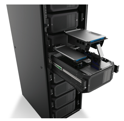
Figure 7. A Rack Mounted HP Z8 G4 installed with an HP Z640/Z840/Z8 Rail Rack Kit (2FZ77AA) showing access to interior Workstation components

Some of our customers need to mount their Workstations into racks that are only 24 inches deep (such as those commonly used in the Broadcast industry), instead of 29-30 inch deep racks, so adjustability is an important objective. The HP Z640/Z840/Z8 Rail Rack Kit is