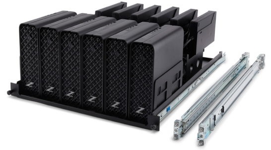
Figure 3. HP Z2 Mini G9 Rack Rail Kit

The HP Z2 Mini G9 is installed in the vertical position and 6 Minis can fit in the 5U space.