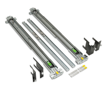
Figure 8. The HP Z8 Rack Rail Upgrade Kit (2FZ76AA) components