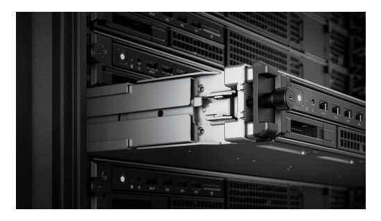
Figure 6. Rack kit Assembly (16G60AA)