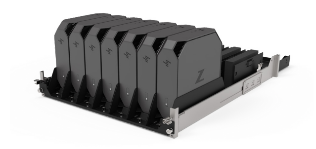
Figure 3. The HP Z2 Mini installed in the HP Z2/Z4/Z6 Depth Adjustable Fixed Rail Rack Kit using the HP Z2 Mini Rack Tray Support Kit (1A4W4AA – Qty1) and the HP Mini Chassis and ePSU Rack Mount Brackets (3RW67AA – Qty 7)

The HP Z2/Z4/Z6 Depth Adjustable Fixed Rail Rack Kit includes a set of fixed-rail support brackets that attach directly to the rack and provide a secure mounting platform for the system-tray and Workstation. The fixed-rails are adjustable and can accommodate racks that are 24-30 inches deep. The HP Z2 Mini is installed in the vertical position and 7 Minis can fit in the 5U space.