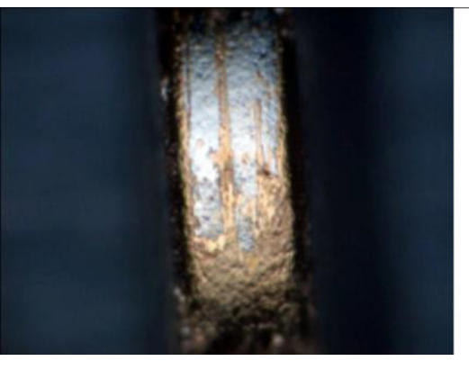
Figure 2. A failing (left) and passing (right) result from the standard socket wear testing procedure.

if not carefully selected, deposited and controlled, can lead to corrosion. A corroded contact can create a point of failure on a system motherboard in a data-sensitive area. The quality of the materials and the chemicals used in our memory sockets, such as the thickness and quality of the gold plating deposition process are carefully evaluated. If necessary, we work with the manufacturers to drive the parts to the proper quality levels.